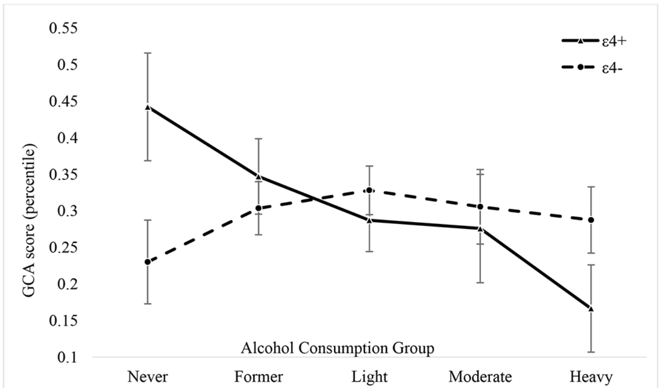
Figure 1. Interaction of Alcohol Consumption and ApoE Genotype on age 56 General Cognitive Ability.

All means and standard errors presented are from the full model analyses controlling for family, age, ethnicity, education, age 20 general cognitive ability (GCA), current smoking status, objective health, subjective health, depressive symptoms, income, and working full-time. GCA is based on the Armed Forces Qualifications Test and percentiles were standardized based on military norms. Solid line is \epsilon 4+ and the dashed line is \epsilon 4- .