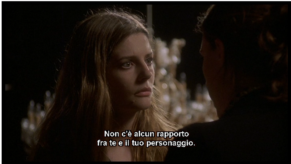
Figure 2. Alberta criticizes Ada's portrayal of Olga. Le parole di mio padre , 2001; Rome, Italy: Cecchi Gori Home Video, 2002.

The stage is now set for Zeno and Augusta to come together. Though she was the first of the sisters to appear to Zeno (other than the young Anna), she has remained in the shadows, being more reserved and timid than her sisters. Augusta, too, practices an art form—ceramics—but in the one scene where we see her at the pottery wheel, the wet clay spins out of control: it is clear that the nurturing and supportive Augusta has another calling. Now that a year has passed since Zeno's first visit to the Malfenti home, it is again time to celebrate Augusta's birthday. She has asked her father to invite Zeno to the party, and Zeno has purchased a wristwatch as a gift (recalling Giovanni's gift to him a year earlier).