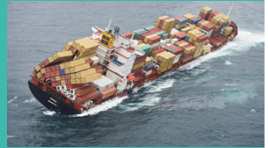
Figure 2. (Left) Plastic litters the Hong Kong shoreline after Typhoon Vicente knocked six shipping containers packed with bags containing millions of plastic pellets into the ocean. (Right) Grounding of the container ship Rena , which carried some containers of plastic beads, off the coast of New Zealand (October 2011).

20 million tons of plastic marine litter enter the ocean each year. 5 We do know that, at some locations, the majority of all observed marine litter tends to be plastic items. 6 For instance, one beach litter monitoring pilot project found plastics to comprise an average of 75 percent of all beach litter on reference beaches in nine North-East Atlantic countries. 7 Temporal trends also remain unclear; however, since plastics production increases by almost 5 percent annually, 8 and because most plastics do not biodegrade in marine environments, it is likely that the concentration of plastics in the ocean has been increasing and will continue to increase over time. 9