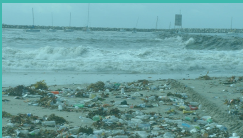
Figure 14. Litter, including plastic litter, covers the beach at the mouth of Ballona Creek in Southern California.

Cities in California and Maryland have led the way in developing TMDLs for California’s Los Angeles River, Ballona Creek, and Santa Monica Bay, and Maryland’s Anacostia River. The Los Angeles-area TMDLs have resulted in the installation of nearly 100,000