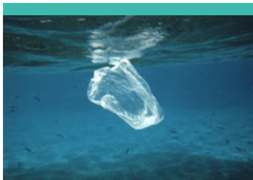
Figure 15. Plastic bag floating in the water column in the Red Sea.

Regulators in coastal watersheds across the United States should develop similar TMDLs for plastic marine litter, using the programs in California and Maryland as models. Coastal areas outside of the United States should use the TMDL system as a model for similar regulatory programs in their jurisdiction. Regulators adopting similar programs should collect local data in order to identify and target the greatest contributors to the pollution problem. Prioritizing high-use generators, such as high-density urban developments or industrial facilities with existing stormwater permits, allows for a rapid initial decrease in marine litter, after which a program can then pursue smaller generators. 124 In most cases, TMDL programs should address floating litter, trash, and litter discharges,