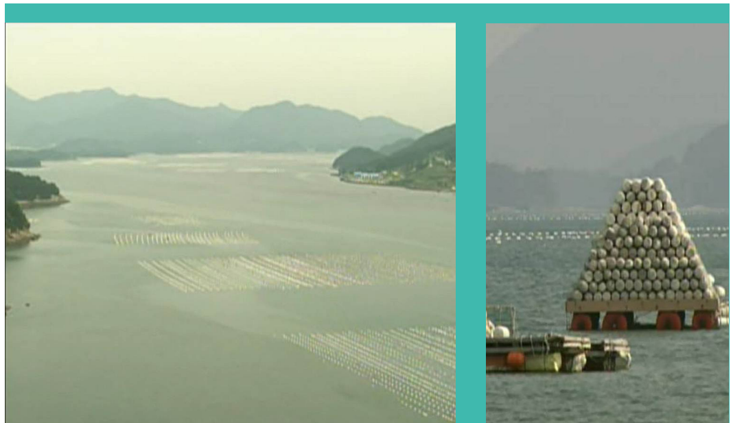
Figure 13. (Left) Oyster aquaculture practices utilizing polystyrene foam. (Right) Polystyrene foam buoys used in oyster aquaculture off of the southern coast of the Korean Peninsula near the City of Busan.