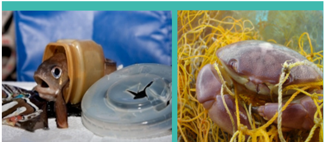
Figure 5. (Left) A Cusk eel hiding inside a plastic container off of Seal Beach, California. (Right) A crab entangled in a ghost fishing net in the coral reefs of the northwestern Hawaiian Islands (2005).

are already tiny—also can enter the ocean. Common sources of primary microplastics include microplastic spills from industrial processing sites or ships, 20 facial scrubs and cosmetic products containing plastic microbeads, 21 industrial spraying and scrubbing of boat hulls, 22 and plastic-based clothing. 23 Microplastics are ubiquitous in marine and coastal environments, and are a growing cause of environmental concern. 24