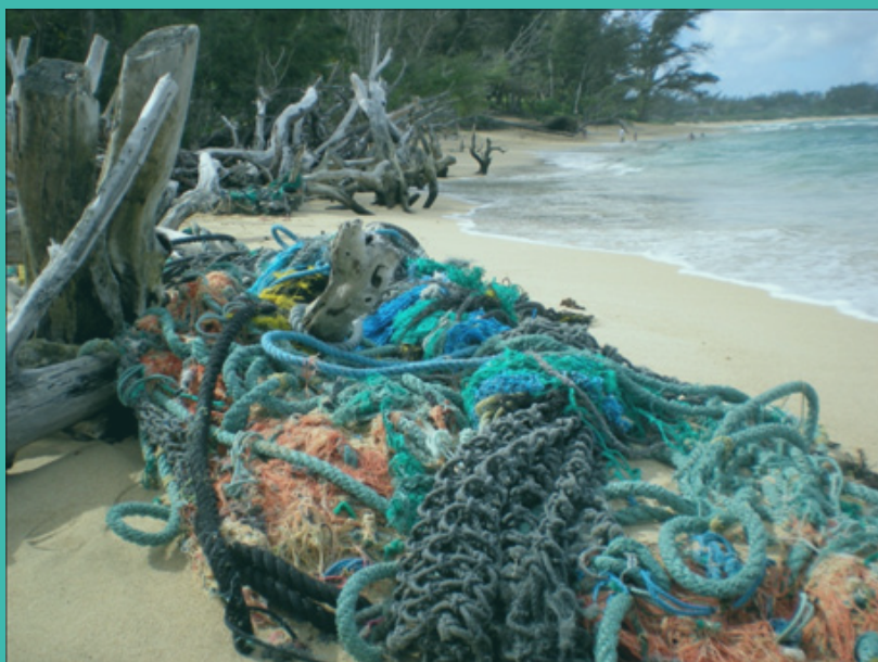
Figure 11. Ghost fishing nets washed up on a beach in Hawaii.

Council, which promotes sustainable wood harvesting, and the Marine Stewardship Council, which promotes sustainable fishing practices. Companies also are increasingly incorporating recycled materials into their products, then touting those products as environmentally friendly through labeling. Additionally, some companies and restaurants are beginning to offer biodegradable or compostable packaging and take-out containers. Incentivizing and standardizing the production of more sustainable products and packaging would aid and grow these nascent corporate efforts, and would help an increasingly educated consumer population to make ocean-friendly choices.