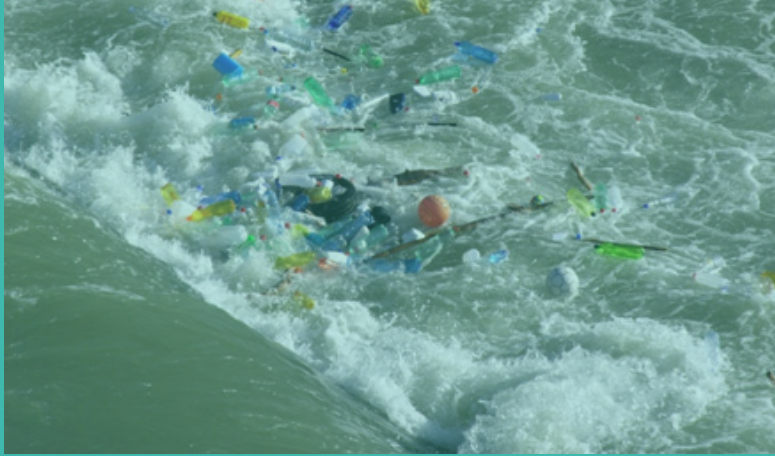
Figure 16. Plastic litter in Rome, Italy's Tiber River heads out to sea (2007).

of marine debris concentrations and maps of marine animals could help identify ocean areas that should be prioritized for clean-up efforts. Additionally, plastics surveys could be added onto planned marine organism studies; archived samples could be checked for plastic concentrations; old video and photographic footage of the deep sea floor could be analyzed; and remote sensing could be employed to identify existing plastic marine litter hotspots. 129 Web-based forums where interested parties can post and obtain information about plastic marine debris, such as the NOAA Marine Debris Clearing House, 130 also can help researchers identify hotspots.