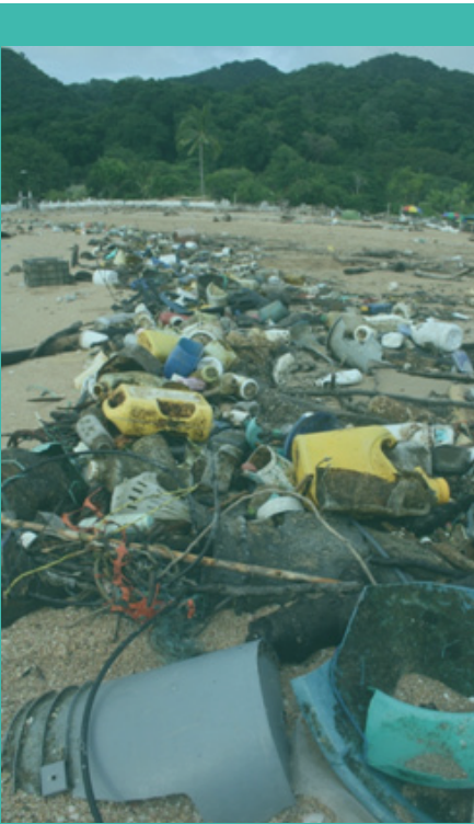
Figure 8. Plastic litter and other trash in Isla Taboga, Panama (2010).

is still difficult to define and enforce. 87 Indeed, it is hard to know what the phrases “best practical means,” “all appropriate measures,” or even “all possible measures” require of countries with differing legal systems, environmental circumstances, and capacities.