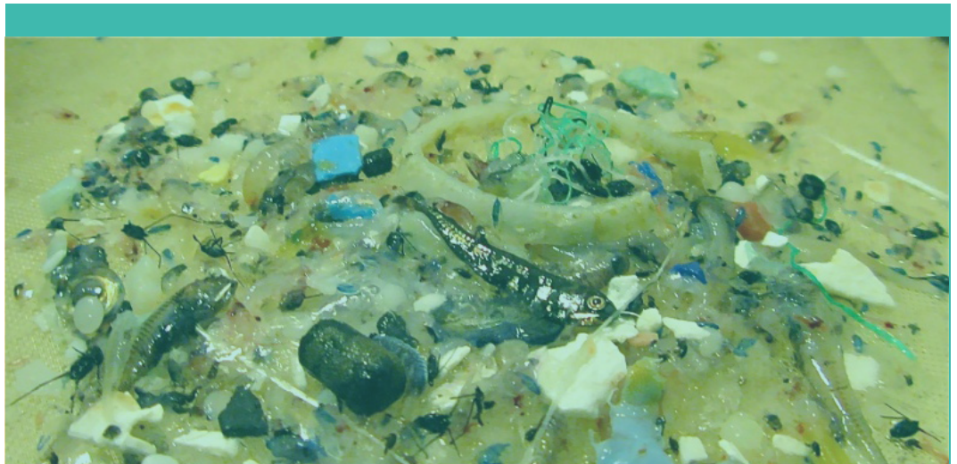
Figure 10. A sample of litter from the garbage patch in the South Pacific subtropical gyre (2011).