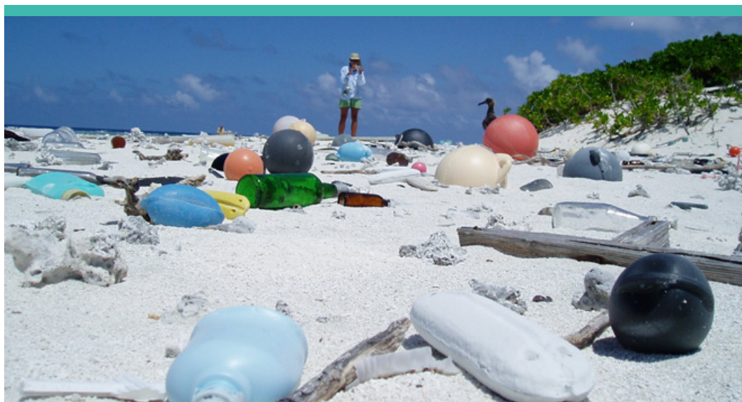
Figure 1. Plastic litter and other trash on the coastline of Green Island, Kure Atoll, Hawaii (2006).

In recent years, global concern about ocean health has keyed in on the growing problem of plastic marine litter. There is a lot we do not know about plastic marine litter; for instance, there is no hard data on exactly how much plastic is in the marine environment. It has been estimated that