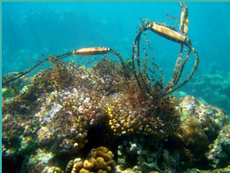
Figure 7. Ghost fishing gear stranded on a coral reef, Mariana Islands, Guam.

Though each of the international instruments