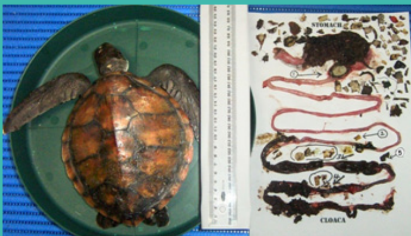
Figure 6. The digestive system contents, including plastic material, of a sea turtle in Green Fingal Beach, Australia (2007).

the production process pose an additional concern. 39 Additives such as bisphenol A (BPA), plasticizers (phthalates), and flame retardant chemicals (polybrominated diphenyl ethers, or PBDEs) are linked to endocrine disruption in wildlife and humans. 40 These additives can dissociate from plastics in the environment and contaminate seawater, or contaminate organisms that ingest plastic litter. 41 Plastic ingestion by smaller organisms leads to a greater potential for bioaccumulation of contaminants, potentially impacting the entire food chain. 42 While further research is needed to determine the proportion of organismal chemical loads that stems from plastics as well as what levels of these chemicals pose a threat to humans, it is clear that an increasing amount of plastic marine litter increases potential risks to humans and wildlife. 43