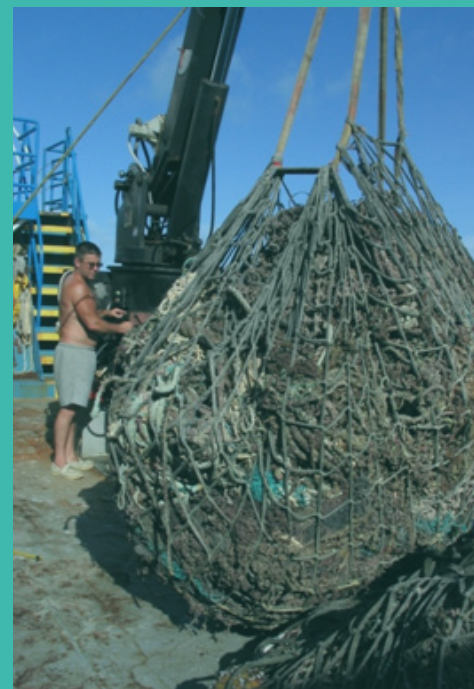
Figure 9. Abandoned ghost fishing nets are loaded onto the deck of the vessel CASITAS in the northwest Hawaiian Islands.