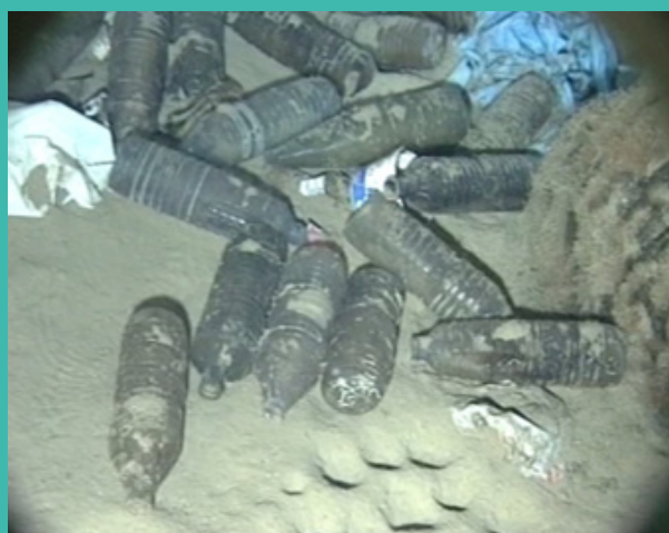
Figure 12. Deep-sea litter, including plastic beverage bottles, 20 km off the Mediterranean coast at a depth of 992 m.

Extended Producer Responsibility (EPR) programs can play an important role in preventing land-based plastic pollution from entering the marine environment. EPR programs hold manufacturers responsible for the handling of their products and product packaging through the end of a product's life. EPR programs also incorporate fee schemes to ensure that manufacturers pay for waste management