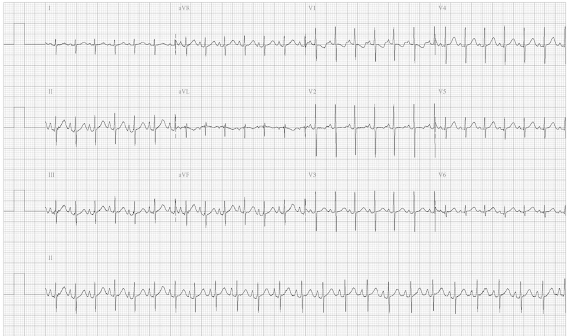
Fig. 2. Example of a standard 10-second ECG tracing recorded with the newborn electrode strip and device.