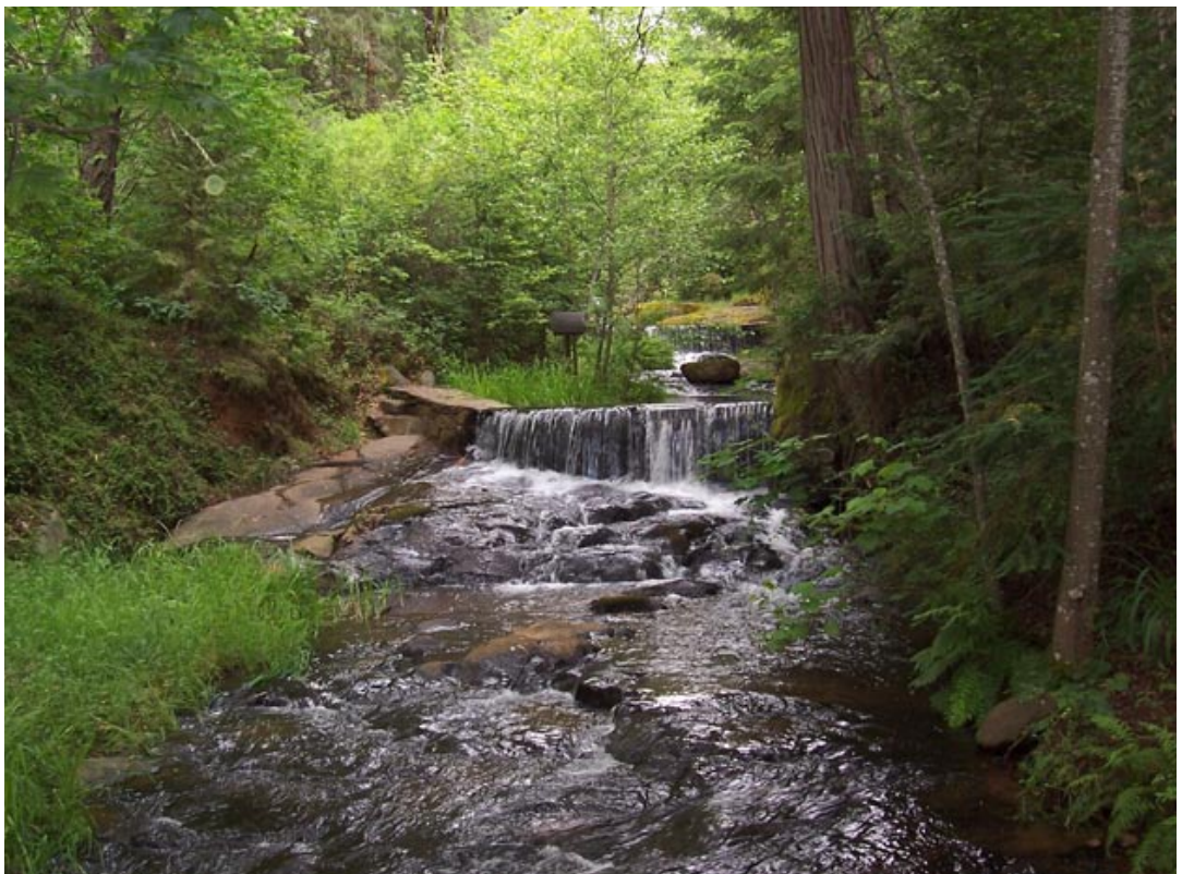
Figure 2. Good salmonid habitat includes pools and fast-water riffles as well as a riparian canopy that provides shade, nutrients, insect habitat, and large woody debris.

One of the major environmental issues in California is the status of anadromous salmonids. Anadromous salmonids have been declining in number in California and throughout the Pacific Northwest for several decades. Specific stocks of chinook, coho, and steelhead have been listed by the federal government (U.S. Fish and Wildlife Service or National Marine Fisheries Service) or the state government