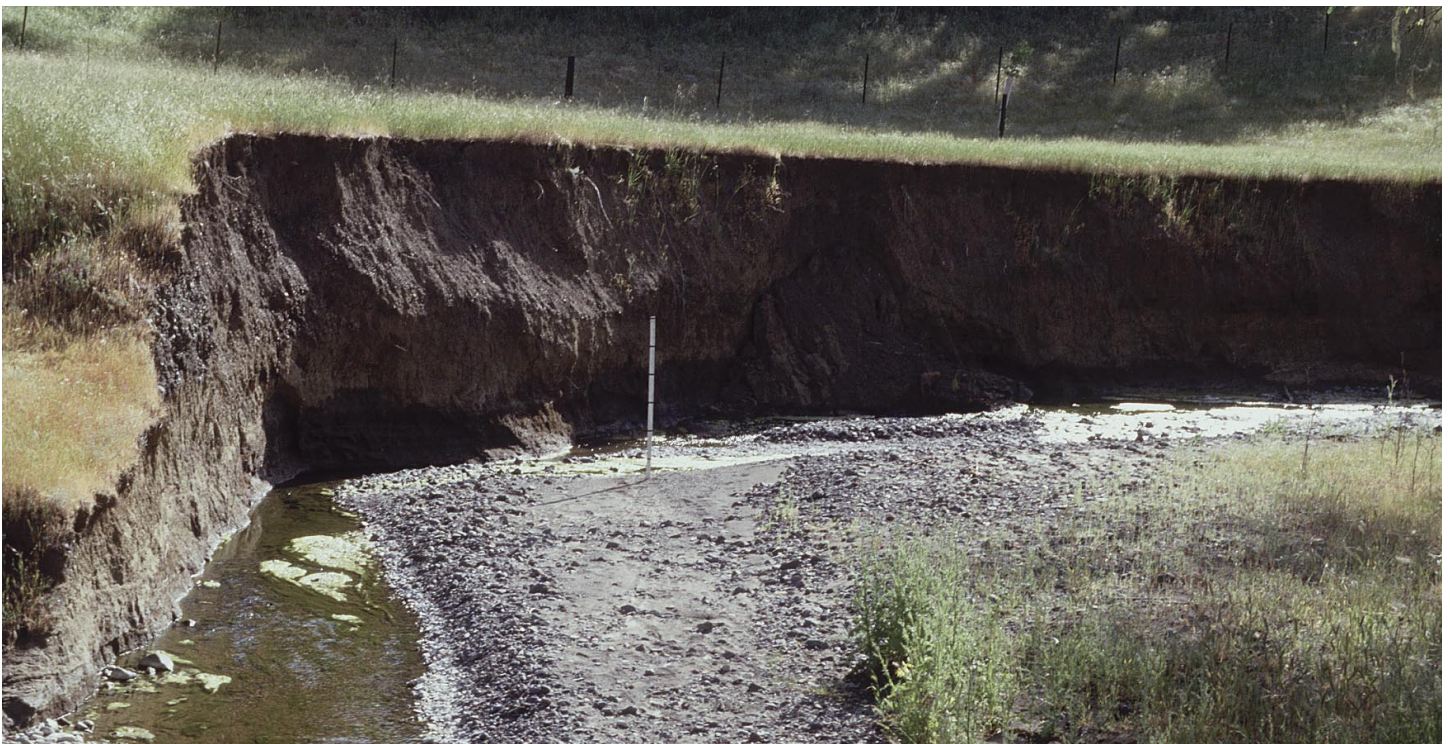
Figure 1. Site 1—Unstable area.

Source sites. Sites that receive “yes” responses to all four criteria are termed “source sites.” These are sites with sediment delivery that can be addressed and controlled (see fig. 2 and appendix C).