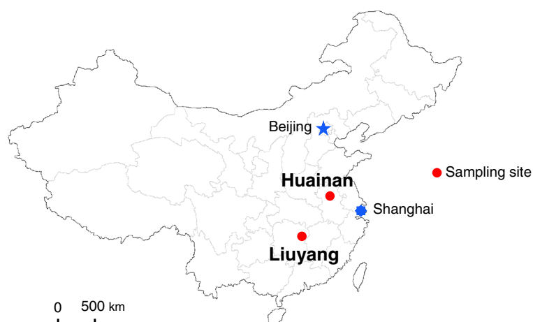
Figure 1 A map of China showing the distribution of mosquito sampling sites.

tube test [11]. For the third method, adult mosquitoes reared from field-collected larvae, 2,000 larvae from more than 100 larval habitats were collected using the standard 350 ml dippers. The larvae were transported to the local rearing facility and reared to adults, and female adults 3–5 days post emergence were tested for deltamethrin resistance using the standard WHO tube [11]. A laboratory susceptible strain that has been maintained in the insectary of the Chinese Center for Disease Control and Prevention in Shanghai, China, for more than 30 years with no insecticide exposure was used as the reference susceptible strain.