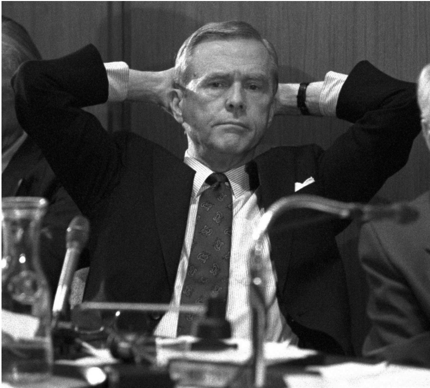
FIGURE 1. Governor Wilson listens as the Reverend Jesse Jackson speaks on affirmative action at the July 1995 Regents' meeting. Los Angeles Times, July 21, 1995, p. 1.

approved SP-1 by a margin of 14 to 10, with one abstention. Jackson and a group of protesters in the overflowing meeting room marked the moment by singing the anthem of the civil rights movement, "We Shall Overcome." The Regents decamped to another conference room to enact SP-2, 15 to 10. 13