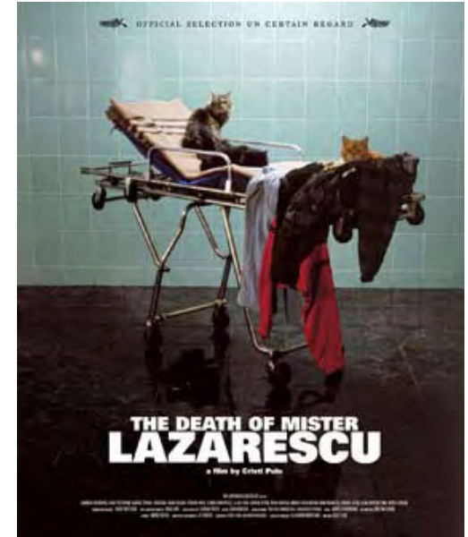
The Death of Mister Lazarescu (2005), Cristi Puiu

The same corporeality is the focus of a predecessor of Mungiu’s film, Cristi Puiu’s The Death of Mr. Lazarescu , winner of “Un Certain Regard Award” at the 2005 Cannes Film Festival. Puiu’s real-time drama is to follow the travails of a sick old man who waits for his illness to overtake him, as a concerned paramedic shuttles him among hospitals that are reluctant to admit him as a patient. This is a movie of