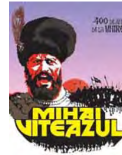
Mihai Viteazul (1970), Sergiu Nicolaescu

A Romanian, French, Belgian, and Israeli co-production, Radu Mihaileanu’s Train de vie (1998)—won twelve international film awards. The film was honored at the Venice Film Festival with the