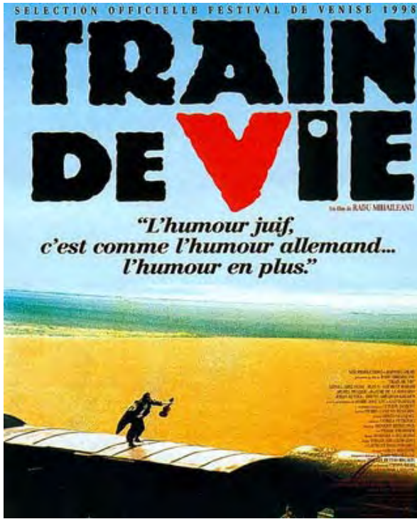
Train de vie (1998), Radu Mihaileanu

music of Goran Bregovic, klezmer music, Jewish traditional shtetl clothes, religious rituals, cuisine, architecture (the houses and the synagogue are made of wood because of the wandering, diasporic nature of the Jewish community), Yiddish language, relationships with Romanian neighbors—in a word: a universe of the Eastern European shtetl à la Marc Chagall.