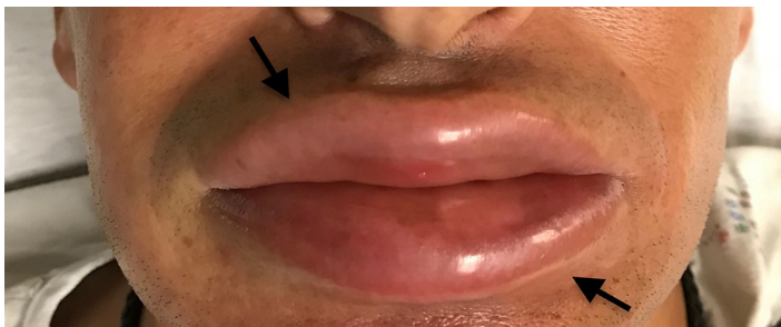
Image. Impressive angioedema diffusely encompassing both lips (arrows).

The patient was placed on two liters per minute of oxygen via nasal cannula, which improved his oxygen saturation to 96%. Initial doses of diphenhydramine, methylprednisolone, and famotidine were administered with no improvement. While still in the ED, his edema progressed, and the patient began to experience difficulty swallowing. Intramuscular epinephrine was then administered with only mild improvement two hours later. He was diagnosed with angioedema of unclear etiology and admitted to the intensive care unit (ICU) for further management. Labs were significant for leukocytosis at a white blood cell count of 10.3 thousand cells per microliter (thousand/mcL) (reference range: 5.0-10.0