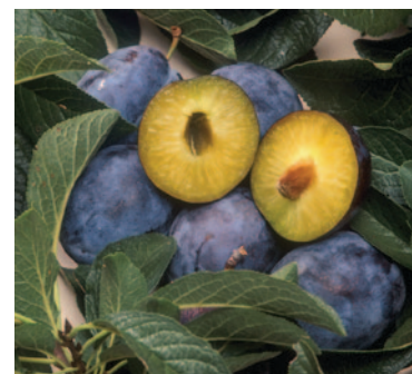
Prunes or plums? An Oregon prune farmer wants to know.