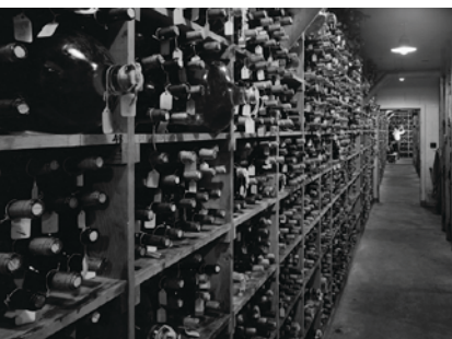
The UC Regents commissioned Ansel Adams to take images for a book commemorating the University’s centennial; Fiat Lux was published in 1967. Adams photographed the UC Davis enology cellars in 1966.

If the prunes I grow and sell are to be called plums, then other members of the Prunus genus might as well