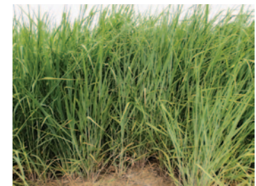
Switchgrass, a promising biofuel, is not considered a noxious weed.