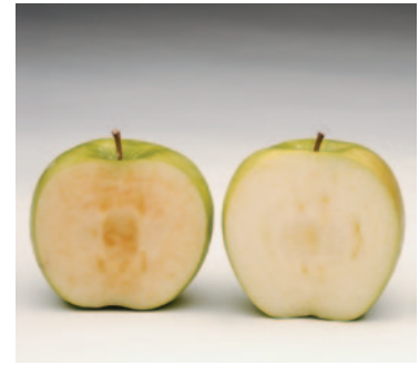
Okanagen Specialty Fruits is seeking regulatory approval for its nonbrowning apple (right).

Regarding "Switchgrass clarification" (Letters, April-June 2012): While switchgrass is no longer on the California Department of Food and Agriculture (CDFA) noxious weed list, it was included as a B-listed species in 2007 (see CDFA's Noxious Times 8(4):1-9). Interestingly, the plant has never been shown to be invasive in California, where it is not native, but it was placed on the list because of the proposed planting of large acreages as a biofuel species. By putting switchgrass on the state's noxious weed list, CDFA was then able to prevent large-scale cultivation until they were assured that it did not have high potential to become an invasive