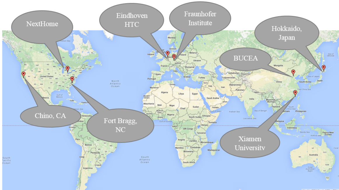
Figure 2. Worldwide Demonstration Sites for DC Distribution in Buildings