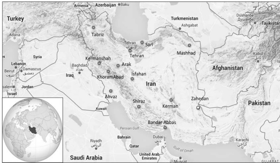
Fig. 1. Cities included in the bio-behavioral surveillance survey of female sex workers in Iran, 2015