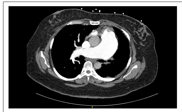
Figure 2. CT angiography chest showing agenesis of left branch of pulmonary artery.

An extensive work up had been performed prior to cardiology being consulted. Initial computerized tomography (CT) angiogram of the chest demonstrated left PA atresia with dilatation of the main and right pulmonary arteries. The main PA measured up to 5.9 cm in diameter. Findings of increased