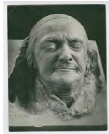
Clara Zetkin, 1933

In the Party hierarchy, what mattered was not only who received a death mask, but who did not. For political elites, the mask was a token of inclusion in the Bolshevik pantheon, but it was also a sign of exclusion or excommunication for those left outside it. Khrushchev, who had been deposed from the post of general secretary seven years before his death, is the only Soviet leader who did not receive a death mask. 34 Among collectors, there is a legend that death masks were made of Nikolai Bukharin and other top figures murdered in Stalin’s terror, evidence of which is located in the Federal Security Service’s closed archives. 35 If so, this would be in keeping with the French Revolution, when a young woman named Marie Grosholtz made death masks of the guillotined heads of figures including Robespierre. She would