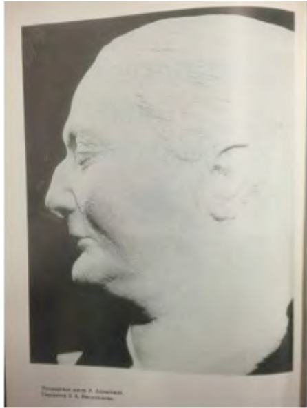
Anna Akhmatova, 1966