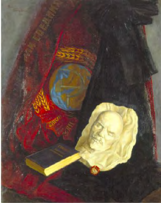
“In Memory of V.I. Lenin” F.G. Bogorodskii, 1934

newspapers in 1969 and again in 1985. 118 It portrays the death mask as a miracle-working relic, its sacred essence working to build socialism in Germany and inspire the devotion of the masses.