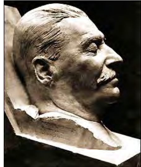
Josef Stalin, 1953