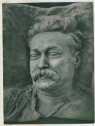
Emel’ian Iaroslavskii, 1943

hagiographer nicknamed “the Soviet pope.” Though Iaroslavskii mocked the concept of an afterlife, his obituaries fit a Christ-like view of immortality into a Bolshevik framework: “When people such as Emel’ian Mikhailovich die, do they really leave this life?” asked his obituary in Pravdist . “No, they remain with us. For Emel’ian Mikhailovich left us a great legacy... the legacy of his life, his embodiment of the true Bolshevik, which we must keep sacred and embody in our own lives.” 31 Merkurov’s death mask of Iaroslavskii, made in 1943, is frozen in a pained whimper. Andrei Zhdanov, Stalin’s chief post-war ideologue, received a mask that includes his shirt collar and tie, a reflection of the business-like style popular among officials after the war.