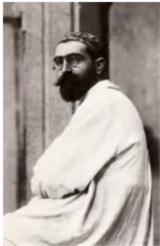
Sergei Merкуроv in the 1920s

Beyond their promise of future commissions, death masks provided a general entrée into the ranks of the Party elite, sealing relationships with people in power. Merкуроv's career arc is