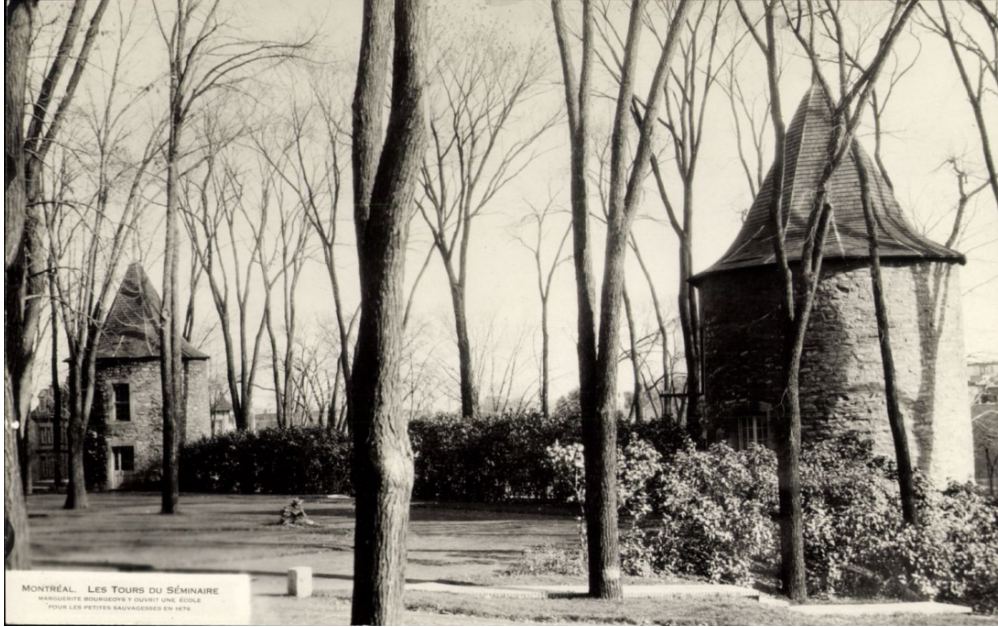
Figure 3. Montréal, les tours du séminaire, Marguerite Bourgeoys y ouvrit une école pour les petites sauvagesses en 1676.