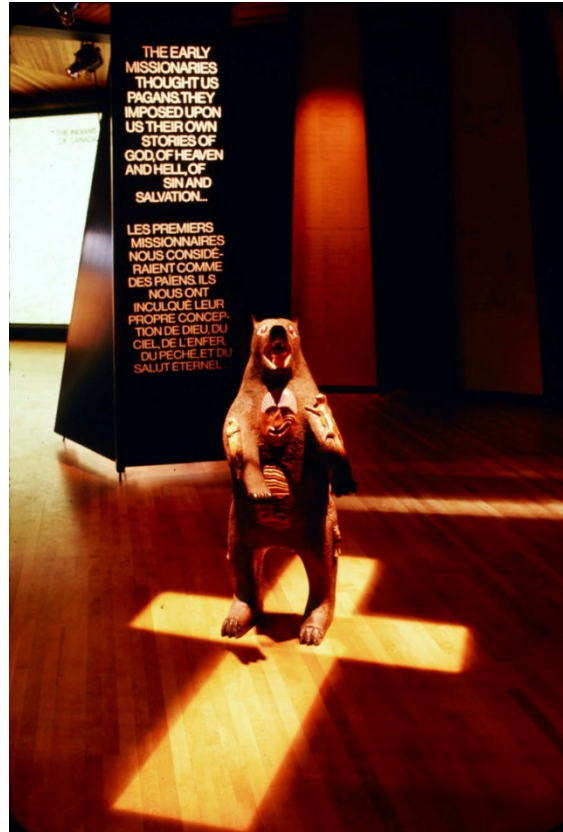
Figure 7. Indians of Canada pavilion – exhibition 1967. RG71, Box number: TCS 00866, Library and Archives Canada.