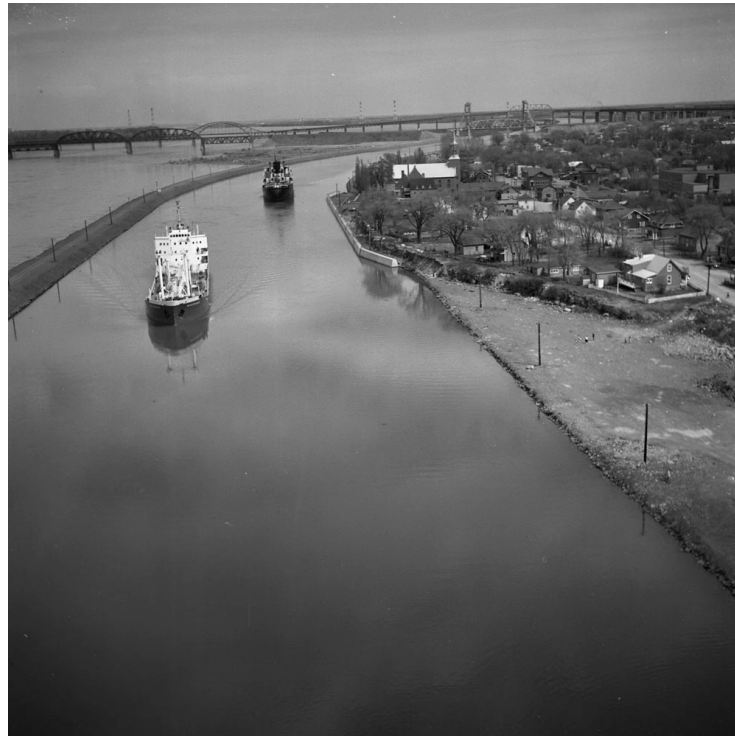
Figure 6. Voie maritime du Saint-Laurent 1959. RG53, Box number: 79, Library and Archives Canada.

Global flows are not unidirectional, and Indigenous agency continues to resist and subvert settler colonialism. The “Indians of Canada” Pavilion at Expo 67 (Figure 7) was a space and place where, for the first time, Indigenous peoples in Canada took charge of their own representation on the world stage and where “the fantasy of integration was replaced by a more realistic narrative that was more fitting with the reality of colonialism” (student statement). Guided by the question, “What do you want to tell the people of Canada and the World when they come to the Expo in 1967?,” the Pavilion provided a glimpse not only on the history as understood and expressed by Indigenous peoples, but also how they imagined a just Indigenous-state relationship if reconciliation was truly intended. Perhaps one of the most controversial pavilions throughout the entire fair, it garnered significant attention from non-Indigenous peoples in the city and beyond at a time when Indigenous-state relationships were strained. Although its legacy remains contested, “by taking control of the messages, the art, and the narrative of the pavilion, Indigenous people were essentially choosing to which extent they wanted to be part of the non-Native Canada narrative. It meant that they were able to draw the line between the two cultures and create the image they wanted the world to have of First Nations in Canada” (student statement).