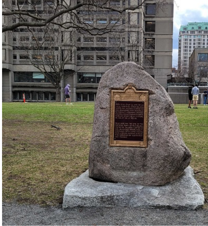
Figure 1. Dawson Site plaque. 2007-CED-SDC-008, Parks Canada.

Located in the historic Old Port neighborhood and commissioned for the 250th anniversary of the city, the Paul Chomedey de Maisonneuve monument celebrates the contributions of the city's founding members to strengthening the French control over the fur trade. Holding the flag of the King of France, the statue of Maisonneuve, founder and first governor of Ville-Marie (Montreal), sits atop the main column (Figure 2). On the northwest side a statue of an "anonymous Iroquois warrior" illustrates the various battles between the French colonists and Iroquois Confederacy in the early decades of the city's foundation. Referencing the detailed bas-reliefs of the monument depicting Maisonneuve's killing of a Haudenosaunee chief the student explained: "for me, this peace is a clear proof of the presence and oppression of First Nations in the beginning of the city's foundation. It is a clear visual of the tragedies and discrimination that Indigenous people lived and still live due to European settlement and oppression." Indeed, during the semester, after many decades of criticism from Indigenous groups, the monument plaque, which made reference to Maisonneuve killing the chief "with his own hands," was changed and the new "message excluded the line about Maisonneuve's busy hands" (Valiante 2018, 1; see also Keating 2017).