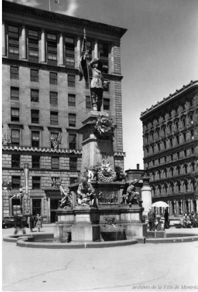
Figure 2. Monument Maisonneuve à la Place d'Armes 1938. CA M001 VM094-Y-1-17-D0200. Ville de Montréal. Section des archives.

Connected to the city's founding, the Mountain Mission established in 1676 by La Congrégation de Notre-Dame de Montréal was the realization of the fundamental objective of the colonial enterprise—to educate and convert Indigenous communities to Christianity. The 1920s postcard caption reads: “Marguerite Bourgeoys y ouvrit une école pour les petites sauvagesses en 1676” (“Marguerite Bourgeoys opens a school for little savages in 1676”, Figure 3). Intended for young Indigenous women and girls, the school was a precursor to the Canadian residential schools that would be established in the rest of the country starting in the 1880s and whose civilizing ambitions will lay bare the cultural genocide of more than a hundred years of operations (TRC 2015). As the student succinctly stated,