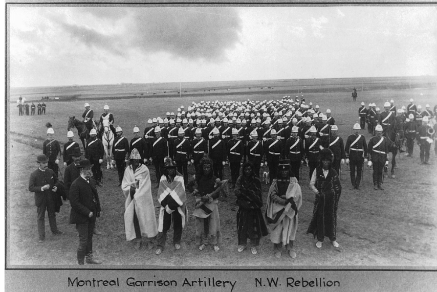
Figure 5. Montreal Garrison Artillery and Aboriginal scouts, North West Rebellion, 1885.

as possible victims in the future, vulnerable to losing their culture and identity by their English government who is only interested in promoting and pursuing their idea of the Nation.”