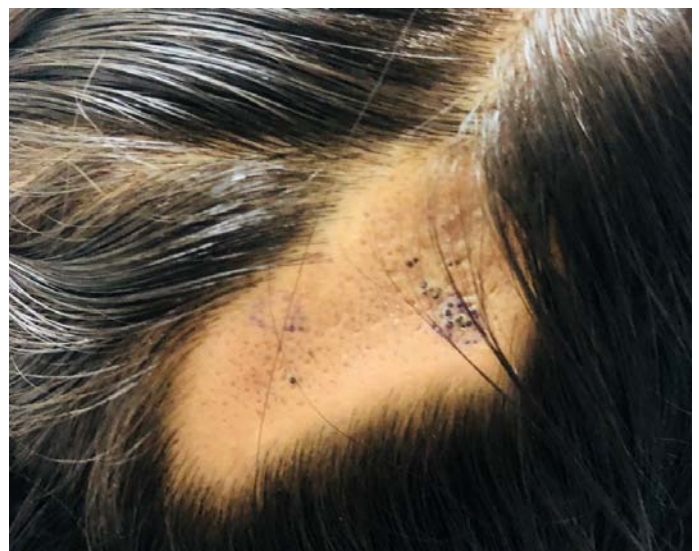
Figure 1. Multiple keratin filled pits on scalp.

A 19-year old woman presented to our outpatient department with a pruritic patch of alopecia over her scalp of two years duration. The plaque was initially small in size, but gradually increased to reach the present size. She noticed discrete hyperpigmented raised papules clustered on certain areas of the alopecic patch. There was no history of any discharge or suppuration from the lesions. No such lesions were present in any of the family members. Two years before the appearance of the plaque, the patient was hospitalized for treatment of congestive heart failure secondary to rheumatic heart disease and she underwent surgery for mitral valve repair. There was no other evidence of any skeletal, mental, or cutaneous abnormalities.