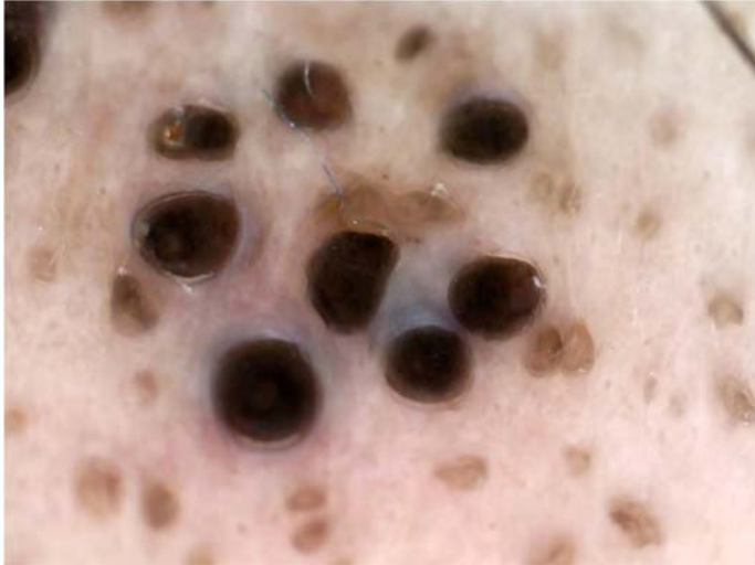
Figure 2. Dermoscopy of nevus comedonicus showing multiple circular and barrel shaped homogenous areas in brown and black shades with keratin plugs.

On examination a patch of alopecia of size 7×4cm was present over the right parietal region of the scalp. The plaque was studded with aggregated discrete pits filled keratinous material with intervening normal skin and in some regions the black plugs protruded above the surface and were firmly adherent to the scalp ( Figure 1 ).