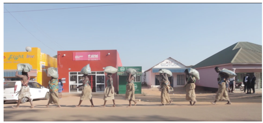
Figure 8 Still image from performance piece of the Tenga Tenga in Mbala.

spirituality from multiple perspectives, even through dress, which is why chitenge material (Dutch wax print, worn from the waist up) is also used as part of the Tenga Tenga attire. This cloth represents a form of Zambian cultural heritage. The story of the Tenga Tenga allows us to re-present history from the perspective of a marginalized group of people who have the potential to shift the perspective of history by adjusting our gaze toward Indigenous peoples' stories.