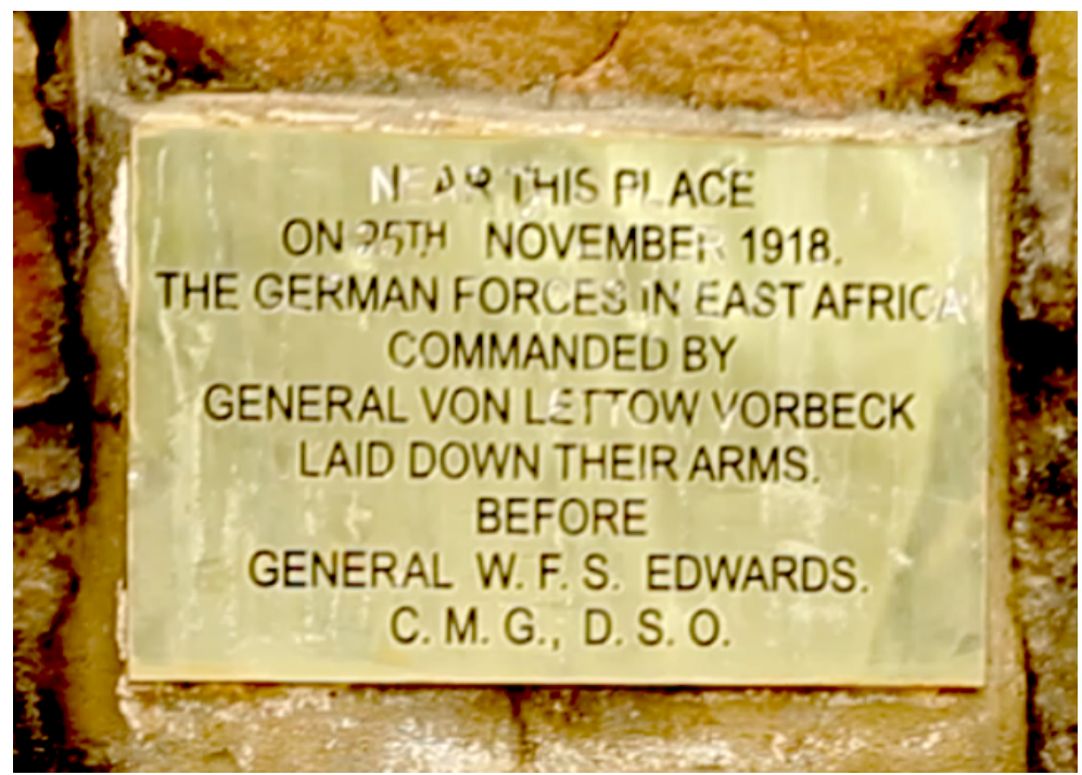
Figure 4 Close-up of the plaque on the monument.