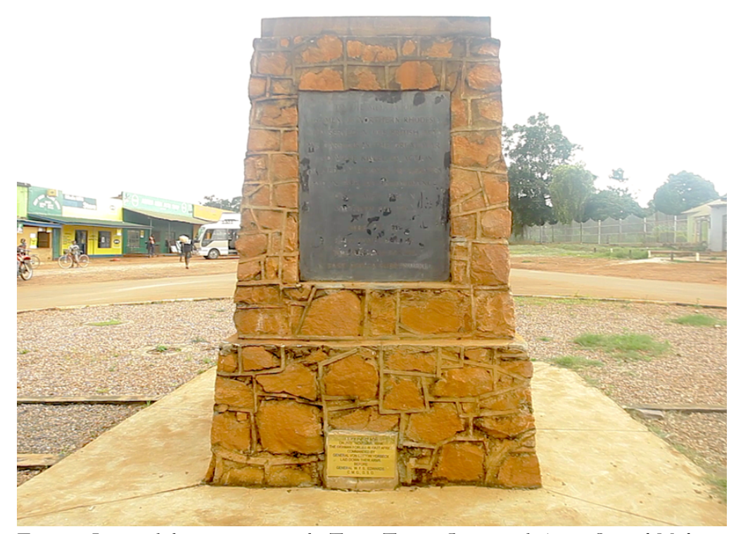
Figure 2 Image of the monument to the Tenga Tenga.

history. For this reason, I began to explore the visual representations of Zambia's history as well as its content by researching topics that I had not encountered in school, such as the story of African porters in World War I, whom I first learned about from the Moto Moto Museum in Mbala, Zambia, and not a history textbook.