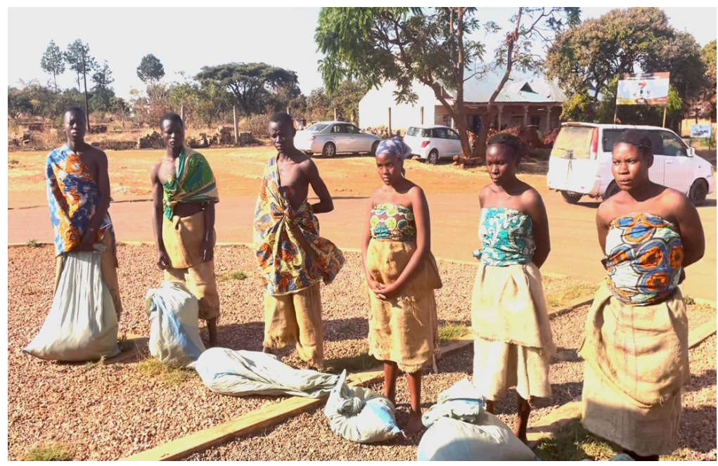
Figure 6 Still image from performance piece of the Tenga Tenga walking through the town of Mbala.

Through this work I seek to foreground and reframe Zambian Indigenous histories and narratives through an engagement with their stories to place them at the center of such conversations. I utilize critical fabulation, a theory developed by Saidiya Hartman² to engage with historical evidence by proposing possible narratives extrapolated from fragments of documentation that were often written from dehumanizing and oppressive perspectives. Critical fabulation has allowed me to imagine ways to interpret the stories of the Tenga Tenga through archival research while attempting to focus on their contribution to World War I, which is all but neglected save for the monument in their honor.