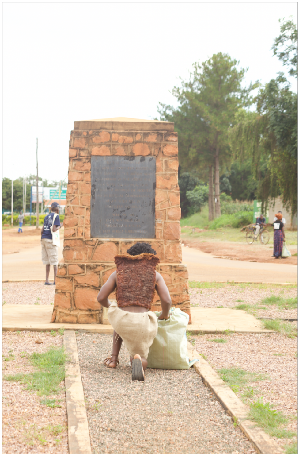
Figure 7 Still image from performance piece of the Tenga Tenga in Mbala.