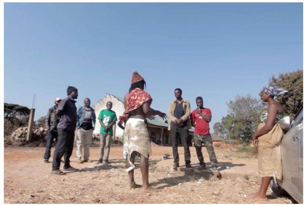
Figure 9 Still image of the artist and one of the performers engaging local residents after the performance. Courtesy of Joseph Kasau, 2021.