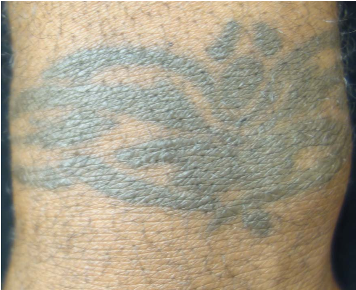
Figure 2. Cutaneous sarcoidosis in tattoos, after minocycline therapy: Complete resolution of right wrist lesion and flattening of tattooed area, 11 weeks after minocycline treatment and 9 weeks after hydroxychloroxine addition is observed.