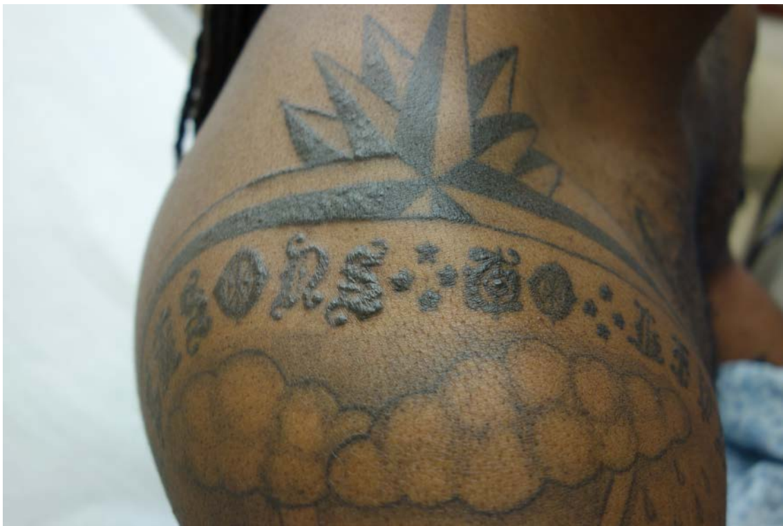
Figure 1A and 1B. Cutaneous sarcoidosis in tattoos, before minocycline therapy 1A) Area on the right wrist with a geometric plaque in the shape of a previous tattoo site 2A) Area on the right upper arm with numerous papules beginning to coalesce into plaques within a previous tattoo site