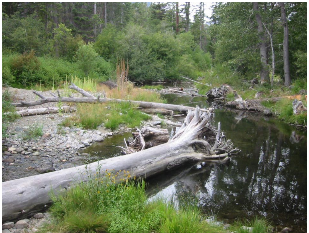
Figure 1. Large woody debris (LWD) creates important habitat for fish and other aquatic species.

Recent research has confirmed that LWD plays a vital role in many stream ecosystems, helping to control the very shape of the channel and providing cover, shelter, and feeding opportunities for aquatic organisms. Unfortunately, California’s streams have lost much of their large wood as a result of human actions. At the same time, the forests and woodlands that should have provided a continuing natural source of LWD in the future have been altered. Now that the role of wood in streams is better understood, land managers and resource agencies have begun both to restore LWD itself and to improve LWD recruitment on timberland. The importance of instream wood is not restricted to timberland, though: LWD is an important natural resource across a diverse range of California’s streams. This publication is intended to provide LWD information for non-timber landowners including ranchers, farmers, and rural and suburban residents.