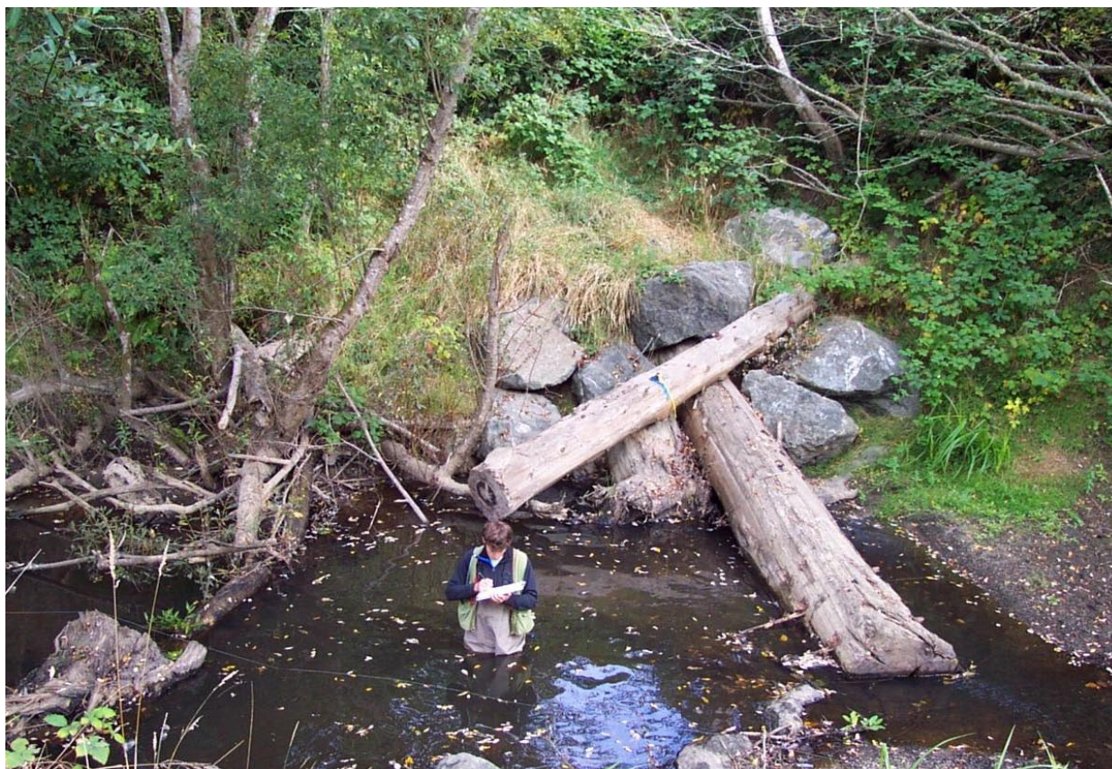
Figure 9. Numerous agencies, organizations, companies, and landowners are now adding large woody debris back into streams as shown here (two logs anchored with boulders).

At times, timber harvest resulted in the deposition of logging debris—called slash —in creeks. In some places, these accumulations of wood were so thick that they became migration barriers blocking fish as they attempted to travel upstream. To remedy this legacy of logging, resource agencies across the West then engaged in wood-removal programs. These “stream-cleaning” operations often removed much of the naturally occurring wood and debris jams along with the logging slash. Until recently, resource agencies assumed that many debris jams were barriers and removed them under goals of salmon habitat restoration. Scientists who have studied fish movement and debris jams have now found that naturally occurring debris jams are very rarely barriers to fish (see sidebar: Debris jams and fish passage ). Nowadays, restoration programs are adding wood back to streams, either by placing log structures ( Figure 9 ) or by encouraging riparian restoration that will provide for long-term LWD recruitment.