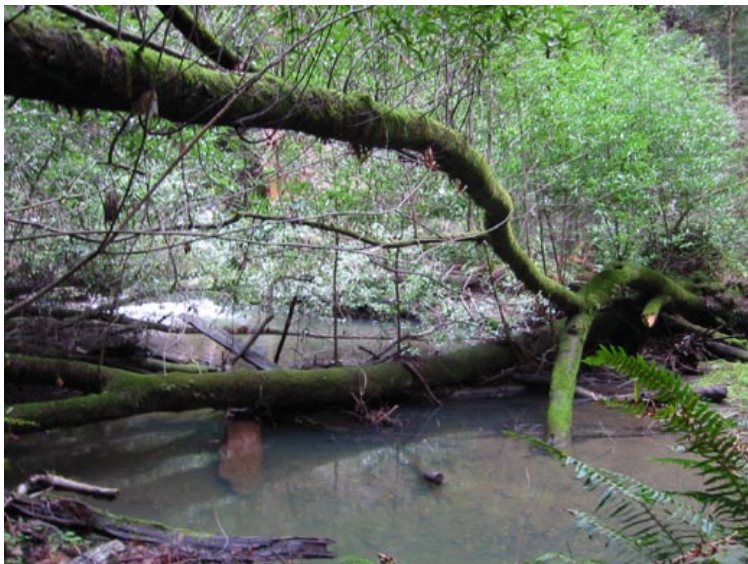
Figure 8. A California bay laurel has fallen into this stream, but remains rooted and living. Numerous sprouts can be seen along the main branches, and the tree is now spanning the stream and contributing to the formation of a pool and storage of organic matter.

important role in these streams? Fish living within these watersheds must survive under the low-flow conditions of the dry, hot summers and could certainly benefit from the pool formation and cover that large wood provides. Recent research has found that, indeed, LWD from riparian hardwoods does provide many of the same habitat benefits—pool formation, cover, and shelter—that have been reported from conifer watersheds.