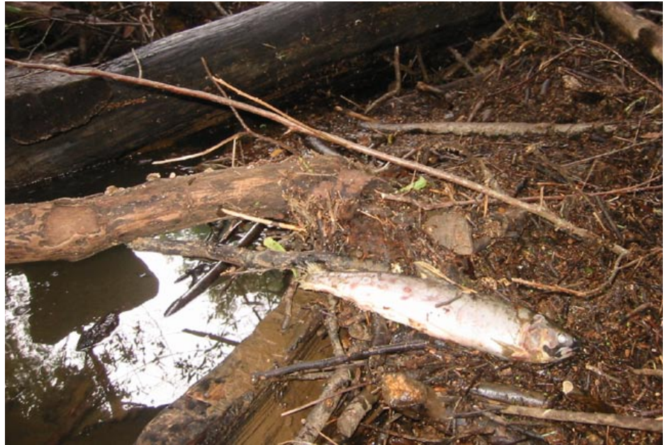
Figure 3. After salmonids spawn and die, their carcasses can be trapped by large wood. The nutrients in the carcasses can then become available to the stream food web, ultimately supporting the growth of juvenile fish.