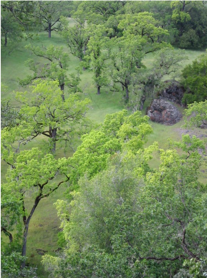
Figure 7. Many of California's hardwood-dominated watersheds support runs of salmon or steelhead.