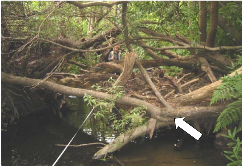
Figure 6. A debris jam has formed behind this key piece of debris ( white arrow ). Note that there are green sprouts to the left of the arrow indicating that this key piece is still alive. This debris jam illustrates two key functions of LWD: pool formation and cover.

Once LWD enters a stream, the processes of transport and decay gradually remove it from the channel. During high flows, wood can be transported downstream or deposited on the stream's floodplain. The ability of a piece of wood to resist this kind of transport and to remain in place is determined by the size of the piece relative to the size of the channel. In very small streams, most pieces of wood are stable because they extend across the channel and are in many cases anchored by standing trees. In large streams and rivers, most LWD is mobile and wood is generally confined to channel banks where it is deposited as high flows recede.