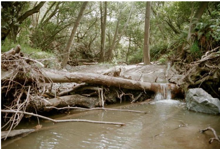
Figure 2. This log stores sediment upstream and during high flows it scours out a pool. The top photograph was taken during a winter storm while the one above was taken during summer baseflow.