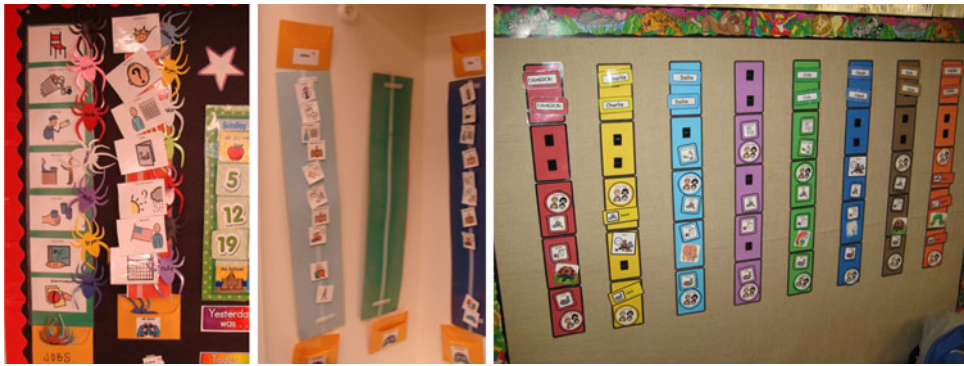
Fig. 6 Analog visual schedules. ( left ) A shared classroom calendar is used to show the activities of the day. An individual student helper for each activity is represented by a spider with the student's name. Spiders were in use at that time, because it was October, and spiders are associated with the Halloween in American folklore. ( center and right )

Individual student schedules include representations for each activity of the day attached via Velcro. Students remove each item as an activity is beginning or ending. Students not present are represented by a schedule with no activities, such as the one in the center here