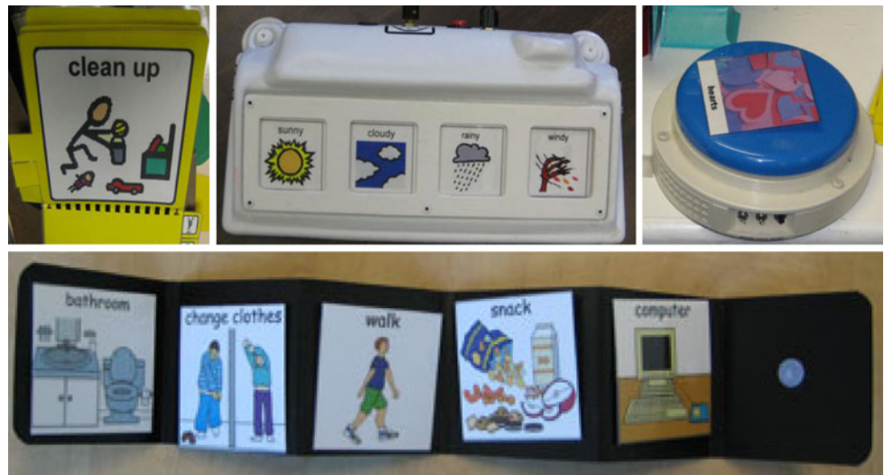
Fig. 2 (top left) A visual prompt to be shown to a child upon requesting that child to “clean up;” (top center) Options to answer a question about today’s weather; (top right) An oversized button that plays a recorded sound when pressed for mediated speech functionality; (bottom) A “communication wallet” carried by a child containing a subset of frequently used cards

useful for caregivers, a more flexible single system was desired if it could be used as successfully as these single purpose tools.