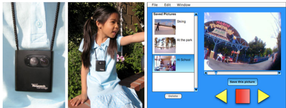
Fig. 9 The SenseCam form factor ( left ) is small enough to be comfortably worn by a child ( center ). A child-friendly viewing interface allows children to review photos with their parents, teachers, and other caregivers ( right )

Other researchers have been developing tools to support children with autism that are related to the three interventions we describe here. Particularly related to the Mocotos prototype is Leo and Leroy's implementation of the Picture Exchange Communication System (PECS) on a Windows SmartPhone [32]. The design of that software is tightly bound to a specific realization of PECS and has been successfully used by children already accustomed to PECS. One of the challenges of use of that tool, however, is the somewhat restrictive nature of PECS. Many of the experts we interviewed requested the need for real-time updating of the picture library, the use of audio cues and other media—even video—and a generally more flexible