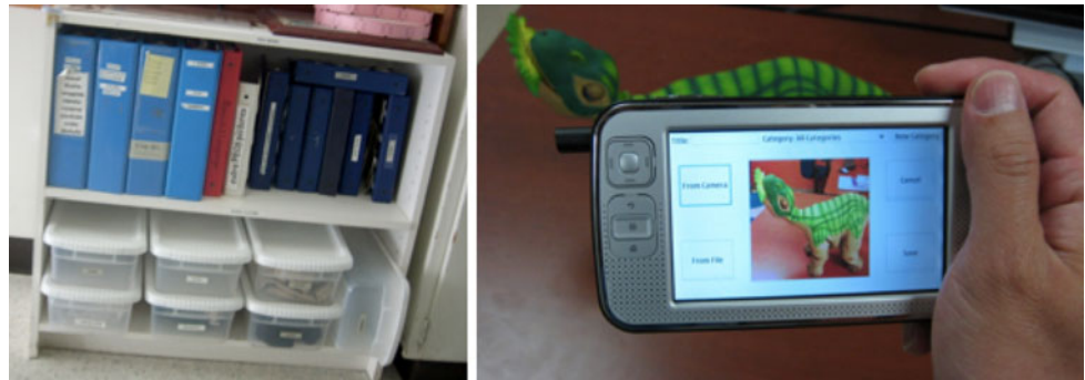
Fig. 4 Traditional visual supports require storage of large quantities of analog images ( left ). Using Mocotos, caregivers can add new images in real time using the built-in camera ( center ). Once images have been loaded using the camera or through the desktop interface, they can be used for communication

cards, and real-time and ad hoc setup of new activities (see Fig. 5).