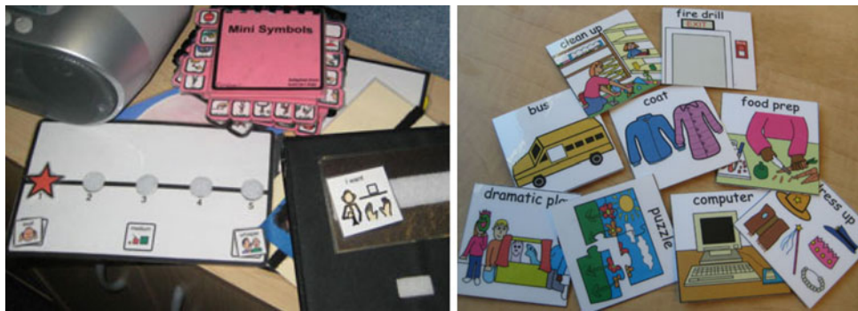
Fig. 1 Paper-based visual supports. ( left , counterclockwise from far left) Rewards charts are used to help students visually track their progress and successes; books of small images can be used to provide a mobile form of visual communication; notebooks with Velcro strips

document diagnostic and evaluative measures over decades. Not only must symptoms, interventions, and progress be documented over very long periods of time, but also they must often be recorded in the middle of everyday life, complete with the challenges of documenting while doing a wide variety of other activities.