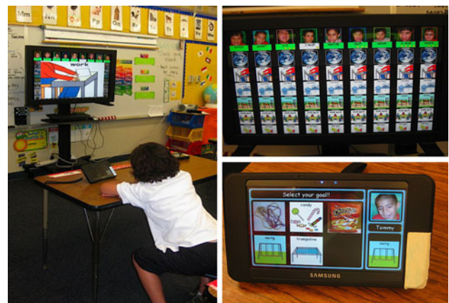
Fig. 7 ( left ) A student sits at his desk during individual work time, while the large display indicates that everyone is working. ( top-right ) The large classroom display showing multiple children's schedules at once. In this case, the schedules are all the same, but that is not necessarily true in all cases. ( bottom right ) An individual student's vSked device showing the first activity of the day, picking a reward toward which the child will work

The vSked system assists teachers in managing their classrooms by providing interfaces for creating, facilitating, and viewing progress of classroom activities based around an interactive visual schedule. vSked includes three different interfaces: a large touch-screen display viewable by the entire classroom, a teacher-centric personal display for administrative control, and a student-centric handheld device for each student (see Fig. 7). The large touch screen, placed at the front of the classroom, acts as a master timetable containing visual schedules for all students. The current activity, denoted by being at the top position, can be activated by the teacher, which in turn starts the activity on the networked students' handheld devices in the form of