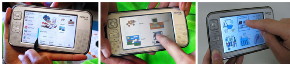
Fig. 5 During caregiver-initiated communication, caregivers set up communication choices using the library of “cards” and can offer as few as one choice for directed instruction or as many as eight choices

Visual schedules can be used at the micro level supporting tasks broken down into sub-elements. For this type of activity, many experts advocate a “First this... Then this...” structure. This structure serves to augment the understanding of time and activities by showing both the sequence of events that compose a larger activity and demonstrating visually a reward or enjoyable event at the end of the task. For example, “Handwashing” can be represented by “First turn on the water and then place your hands under the water,”. A caregiver might end the “handwashing” sequence with a picture of dinner, indicating that once “handwashing” is completed, the enjoyable activity of eating dinner will take place. The First/Then structure can also be used at a more macro level as in “First work, then play.” Similar structures are present in other interventions for person with memory impairments, such as those suggested by Labelle and Mihailidis [31]. An important distinction between visual schedules and those projects, however, is the ultimate goal of using visual schedules. This intervention technique serves not only to augment the ability of individuals to manage the situations to which they are applied, but ultimately they are intended also to teach persons affected by these disabilities to self-