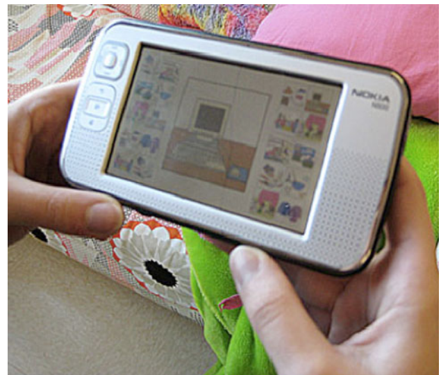
Fig. 3 Mocotos prototype showing library of available cards. When in this mode, selecting a card will enlarge it in the center for previewing

The primary interface metaphor consists of virtual picture cards. Mocotos come with a preinstalled comprehensive library of cards. These cards include the standard iconography used throughout PECS and other visual communication strategies. Despite their nearly universal use in special education classrooms, our fieldwork also revealed the typical practice of photographing common