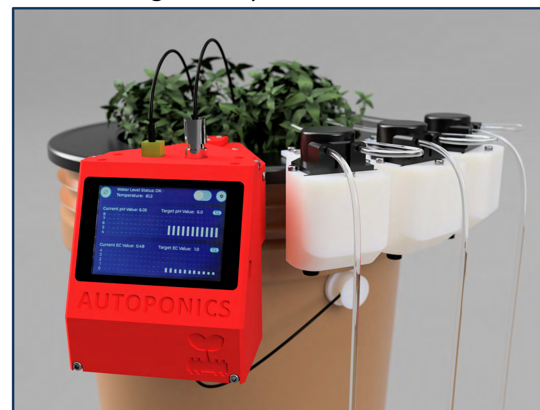
Figure 2: Rendered CAD of a complete system