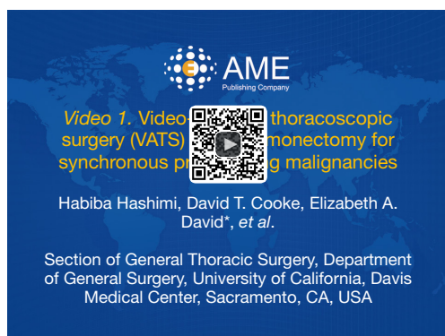
Figure 1 Video-assisted thoracoscopic surgery (VATS) left pneumonectomy for synchronous primary lung malignancies (23). Available online: http://www.asvide.com/articles/942

age (10,14,16,17). Though VATS procedures are more technically demanding, after advanced training using this approach and an initial learning curve, VATS may allow for more accurate dissection via enhanced illumination and magnification (4,6,11,18,19). Although rare, timely conversion to thoracotomy during VATS procedures may be necessary to avoid irreversible consequences. Reasons for conversion include uncontrolled bleeding, pleural adhesions, bronchial injury, and contralateral pneumothorax (5,8,11). As the proportion of converted cases decrease with increased surgical experience in VATS procedures, a simultaneous increase in mortality benefit is expected (20).