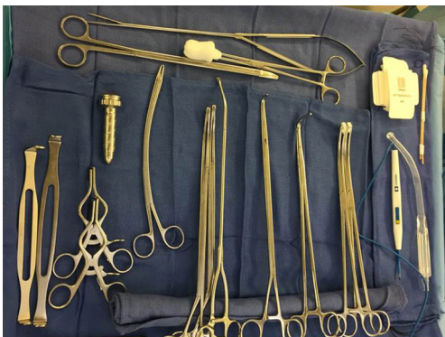
Figure 4 Instrument tray for VATS pneumonectomy. VATS, video-assisted thoracoscopic surgery.

or (II) left lower lobectomy with radiation to the lingular malignancy. After shared-decision making, our patient elected to undergo the option resulting in completion of left pneumonectomy.