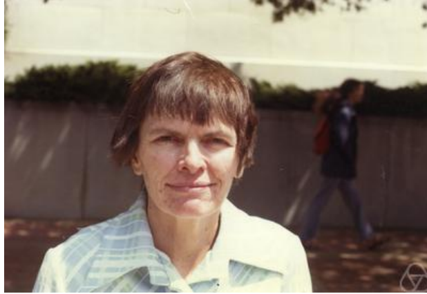
Julia Robinson, 1975.