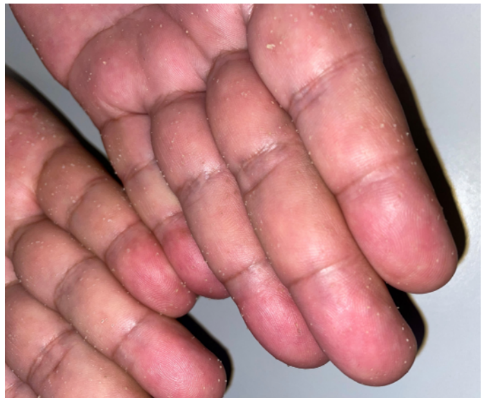
Figure 1. Multiple millimetric keratotic filiform papules on the palmar surface of both hands, including fingers.

“Music-box” spiny keratoderma (SKD) is a rare palmoplantar keratoderma that presents with few to numerous millimetric hyperkeratotic projections on the palms and soles. The pathophysiology of SKD is unknown but may involve either abnormal or ectopic keratinization [1]. Inherited forms (autosomal dominant inheritance) typically begin in the first to third decade of life and acquired forms usually appear later in adulthood [1-3]. They can be idiopathic or arise in association with internal malignancies (breast, colon, kidney, lung, skin, and hematologic neoplasms), [4]. Notably, there have been described fewer than 50 different cases of spiny keratoderma and about a third of these have been reported in patients with personal history of malignancies [5]. Acquired SKD has also been