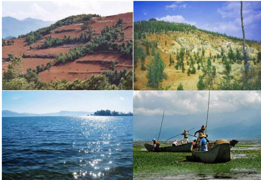
Landscapes in Yunnan. (Above) stable, cultivated terraced slopes contrast with badly gullied slopes, (Below). The clear waters of lake Erhai before 2001 contrast with more recent algal contamination

In some localities, slow deterioration has now become a vortex – a rapid downward spiral. Some aquatic ecosystems have dropped over tipping points into new states where clear lakes suddenly become dominated by green algae with losses of high-value fish. These states frustrate continued high-level production of crops and fish, and they are very difficult and expensive to restore. Natural processes are degraded and destabilised to the point that they cannot be depended upon to support intensive agriculture in the near future. The whole region is losing its ability to withstand the impact of extreme events, from typhoons to global commodity prices.