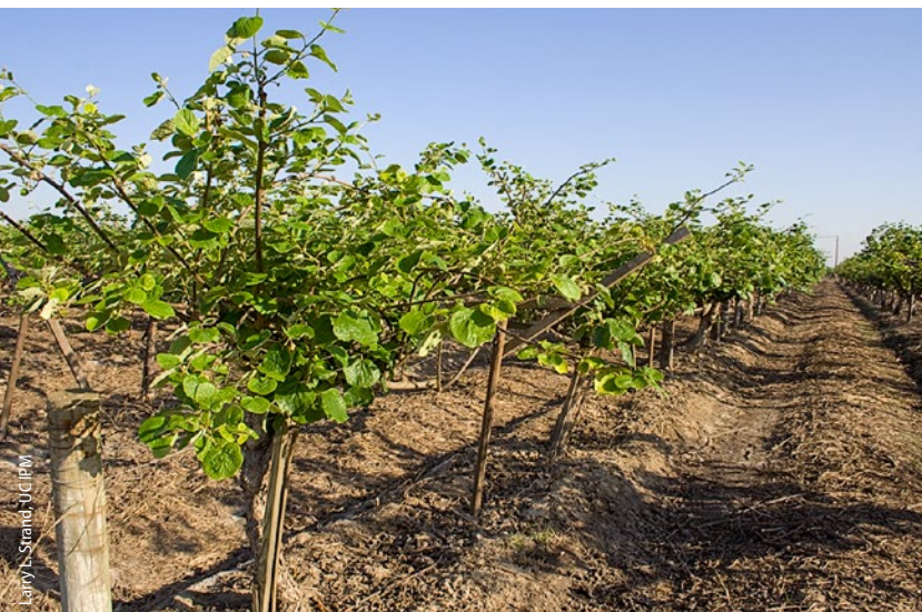
A kiwifruit vineyard at the Kearney Agricultural Research and Extension Center.