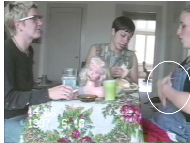
Moves gesture to abdomen