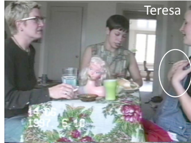
Begins hairy chest gesture at chest