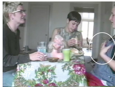
Moves gesture to chest in “T” shape