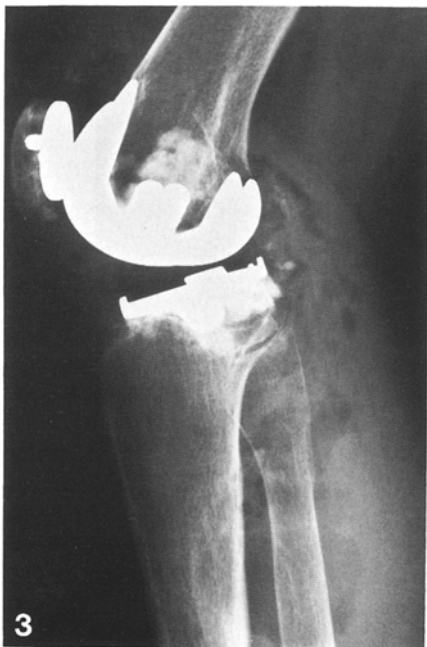
Fig. 3. Air arthrogram. Air freely communicates with the large cyst