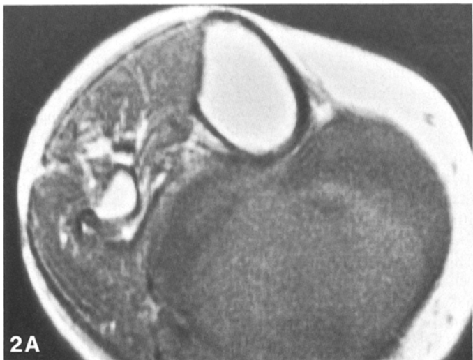
Fig. 2 A, B. Magnetic resonance (MR) imaging of the area of the proximal portion of the calf shows (A) T1-weighted axial scan (SE 500/22) and (B) T2-weighted axial scan (SE 2000/85). Central portion of the mass shows signal characteristics indicating blood

Fig. 1. Coronal ultrasound scan just below the knee shows a relatively homogeneous mass with scattered areas of acoustic shadowing