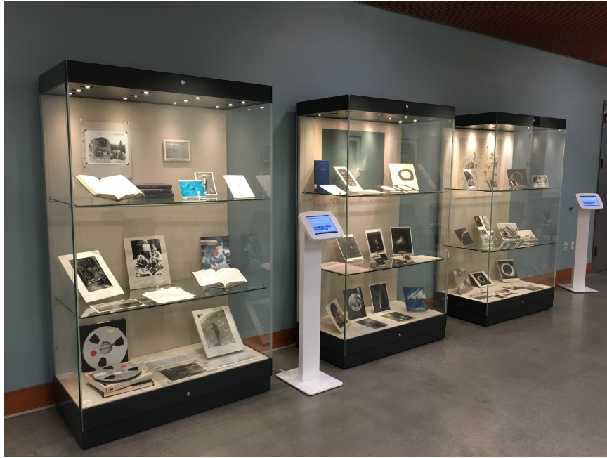
Reading Nature: Observing Science exhibit