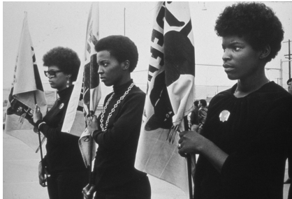
Ruth-Marion Baruch and Pirkle Jones, "A Photo Essay on the Black Panthers." http://exhibits.library.ucsc.edu/items/show/337 .