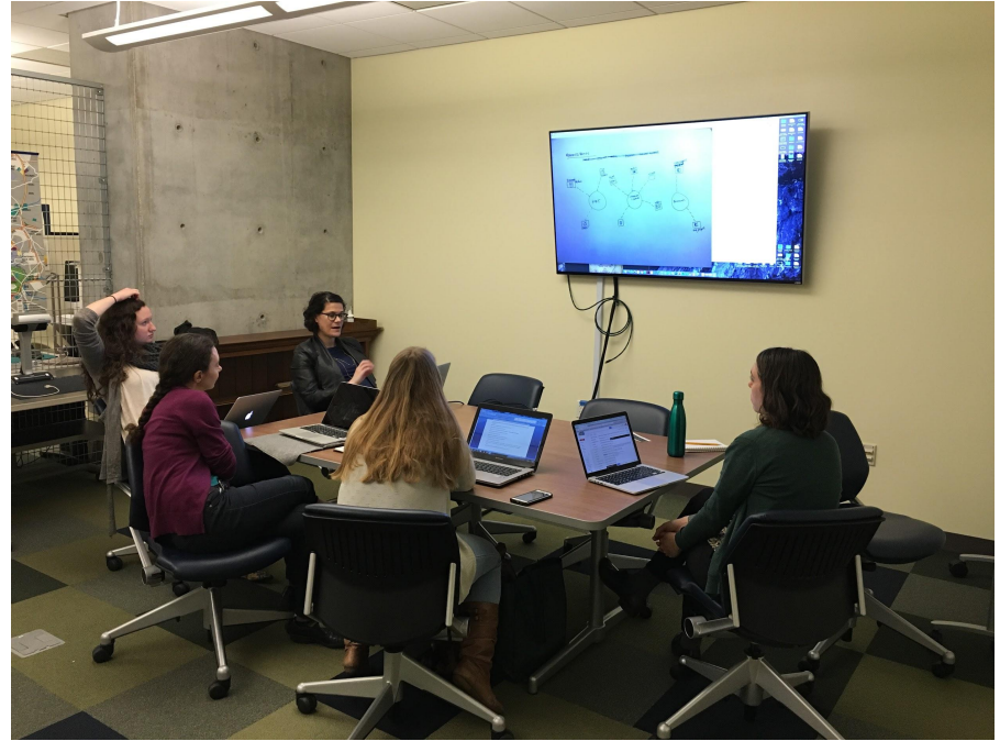
Meeting in the Digital Scholarship Commons