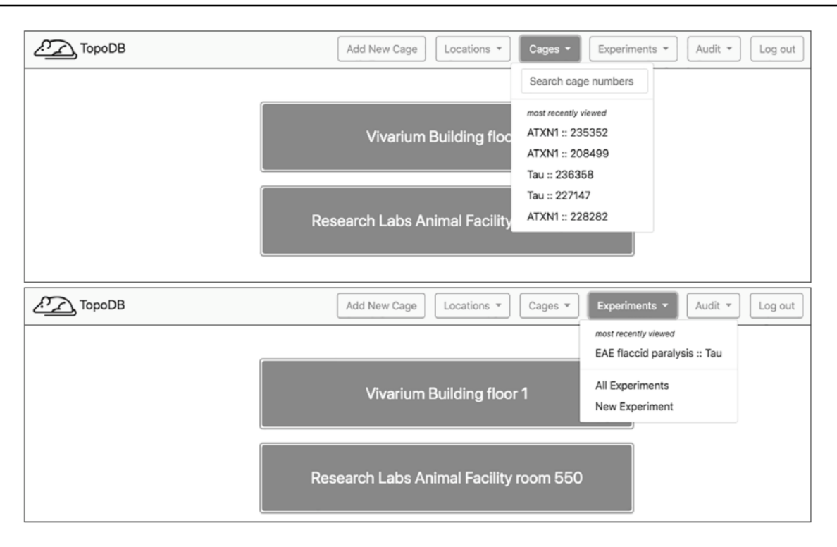
Figure 2. Upon login, a home page showing the top level of cage organization-Locations-is shown. A navigation bar at the top of each page enables users to quickly access recently visited cages and experiments. A search box also assists in finding specific cages.

displayed within the table cell, showing users whether their inputs were accepted. These data entry transactions are performed asynchronously by the browser, so users can update any number of data points for all mice without refreshing the page.