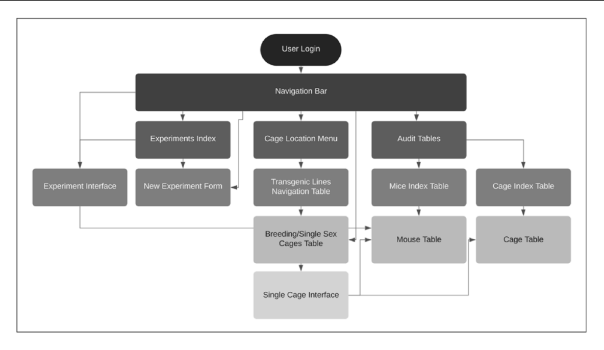
Figure 1. TopoDB website architecture.

(CFA) with 4 mg/mL of Mycobacterium tuberculosis (Difco Laboratories). Mice also received 400 ng of pertussis toxin (List Biological Laboratories) intraperitoneally at the time of immunization and 48 h later. Control mice were mock injected with everything except the MOG peptide. For all experiments, animals were observed daily, and clinical signs were assessed as follows: 0, no signs; 1, decreased tail tone; 2, mild monoparesis or paraparesis; 3, severe paraparesis; 4, paraplegia; 5, quadriparesis and 6, moribund or death. All scores were assigned blindly to the treatment of the mice.