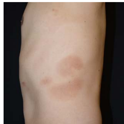
Figure 1. Erythematous patches on the left flank.

A 57-year-old man presented with a one-year history of asymptomatic scaly erythematous patches on the left flank and bilateral dorsal lower legs with less than 10% body surface involvement ( Figure 1 ). Skin biopsy revealed relatively large atypical lymphocytes and a paucity of spongiosis ( Figure 2 ). CD3 and CD4 staining were positive for intraepidermal atypical lymphocytes. CD7 and CD8 reactivities were less robust and were mainly restricted to dermal lymphocytes. Staging showed no involvement of the visceral organs or peripheral blood, which indicated stage IA. We treated the patient with narrow-band ultraviolet B (nUVB) phototherapy once every two weeks along with topical corticosteroid therapy