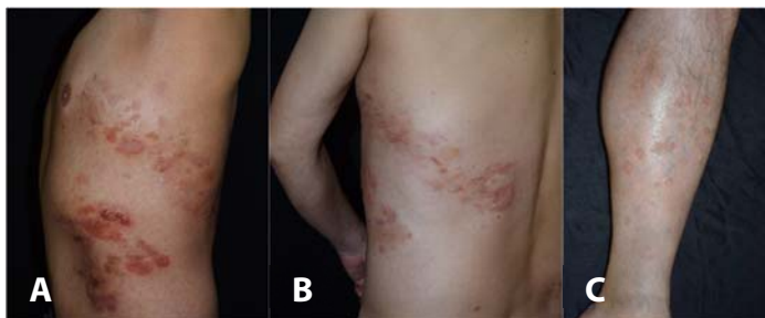
Figure 3. A) Red plaques and tumors on the left flank, B) back. C) Erythematous patches on the dorsal lower legs.

Immunohistochemical analysis revealed that these small atypical lymphocytes were positive for both CD3 and CD4 and that the large lymphocytes were CD30 positive. Southern blot analysis, using a T cell receptor beta-chain probe, revealed a new band of rearranged DNA, which confirmed monoclonality.