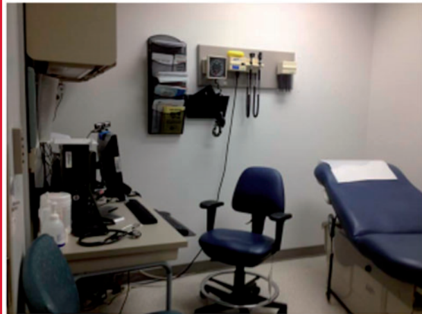
Figure 2: The exam room computer workstation with the EHR system.