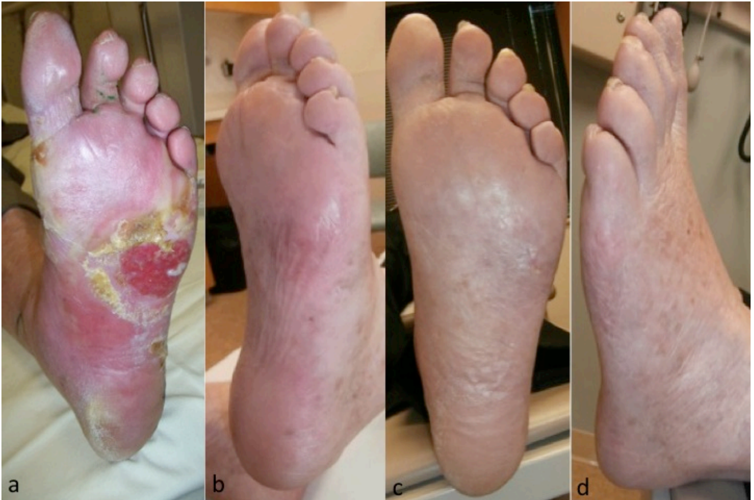
Figure 4 Parts a-d. Post-treatment clinical response at 0 months (a), 2 months (b), and 5 months (c and d)