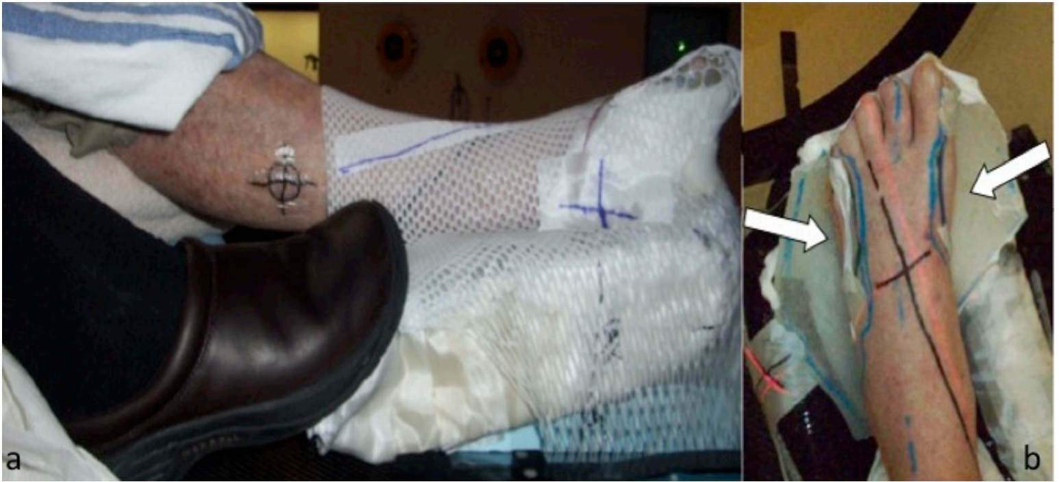
Figure 3 Parts a-b. The thermoplastic mesh boot surrounding a 1 cm tissue-equivalent custom bolus (arrows). The tissue-equivalent acts to absorb photons and protect normal tissue outside of the therapeutic field.

completion of his intensity modulated radiation therapy regimen (Figure 4a). Clearing was achieved and maintained at two and five months after completing treatment (Figures 4b-d).