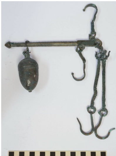
Figure 4. Copper alloy steelyard with counterweight in form of an acorn from I.11.6.7.