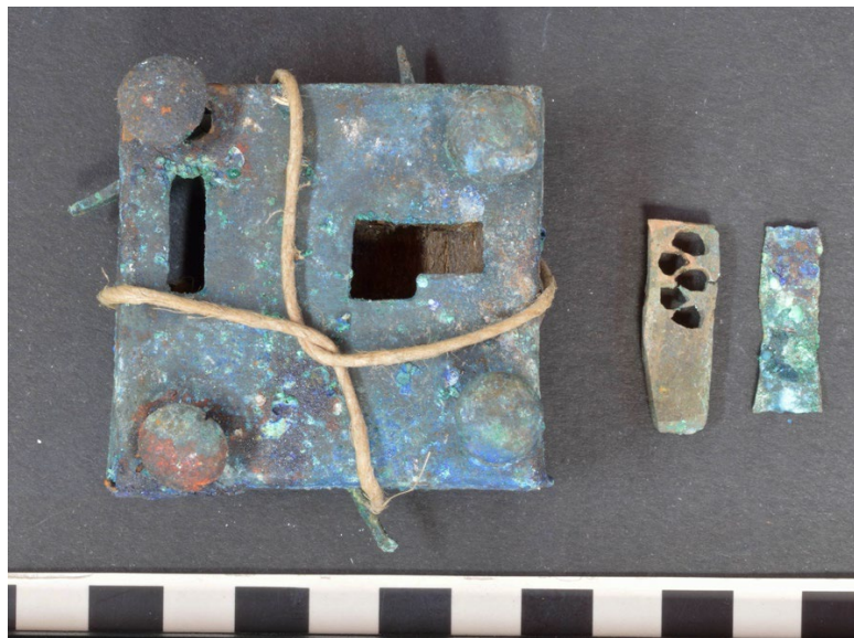
Figure 6. Copper alloy lock box with fixing nails (left), deadbolt (center) and tumbler spring (right) from slide lock fitted to storage box from I.11.6.7.