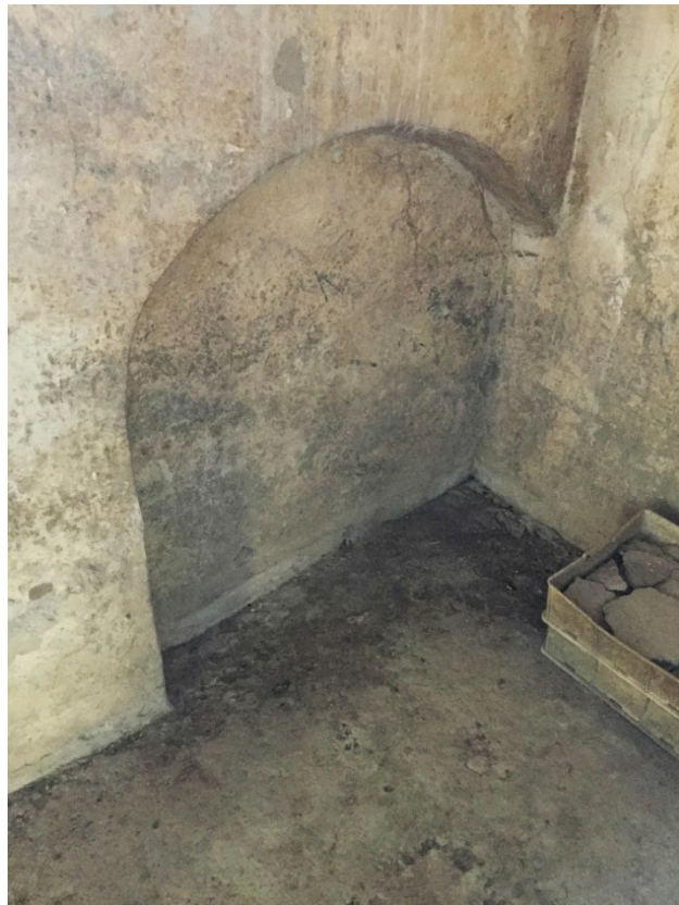
Figure 9. Recess for bed/dining couch in I.11.16.