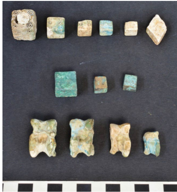
Figure 5. Worked bone and copper alloy dice (top, middle) and bone astragals (bottom) from I.11.6.7.