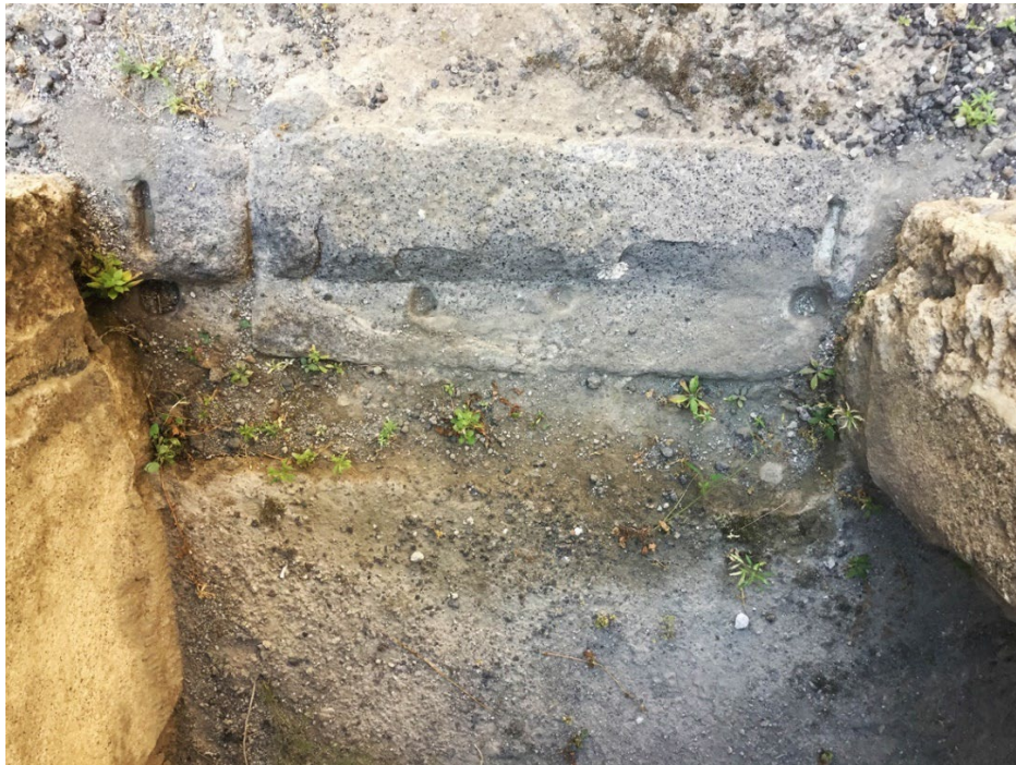
Figure 8. Threshold block in interior doorway in I.11.6.7 with cuttings for pivots for double leaf door and drop bolts.