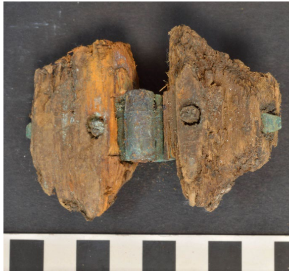
Figure 7 Copper alloy strap hinge with iron pin from piece of storage furniture preserving iron fixing nails and portions of wood panel and framing element on it was which mounted.