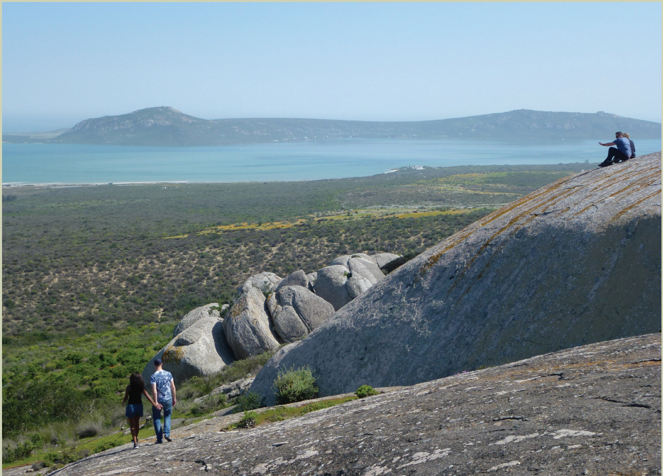
Figure 3. A landscape in the West Coast National Park, South Africa.

Geoscience can contribute to improving healthy environments, such as by understanding the origins and movement of pollutants through the environment. In addition, WHO (2021) has recently promoted the benefits of being out in nature. For example, increased contact with nature has been associated with lowering cortisol, blood pressure, and the risk of developing type 2 diabetes. Nature provides opportunities for stress reduction, physical exercise, and a physically active lifestyle; for restoration and relaxation; and for socializing with friends and family. Access to nature increases life satisfaction and happiness ratings (WHO 2021). Although frequently only green spaces or biodiversity are mentioned in connection with natural health benefits, they often come from access to diverse physical landscapes (Figure 3) or the physical exercise involved in hiking, hill walking, or rock climbing. There is increasing use of mobile geology and geoheritage apps and other new technologies that