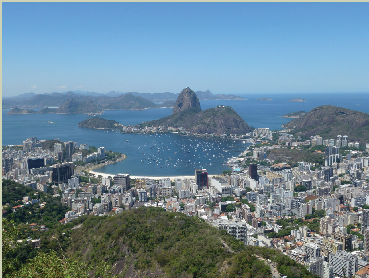
Figure 4. Rio de Janeiro from Corcovado.

Global demand for natural resources is rapidly increasing as countries seek to develop their economies and improve the living standards of their populations. Global material use tripled between 1977 and 2017, by which time it had reached 92 billion tons. Over half of this is in the form of low-cost construction aggregates rather than the more