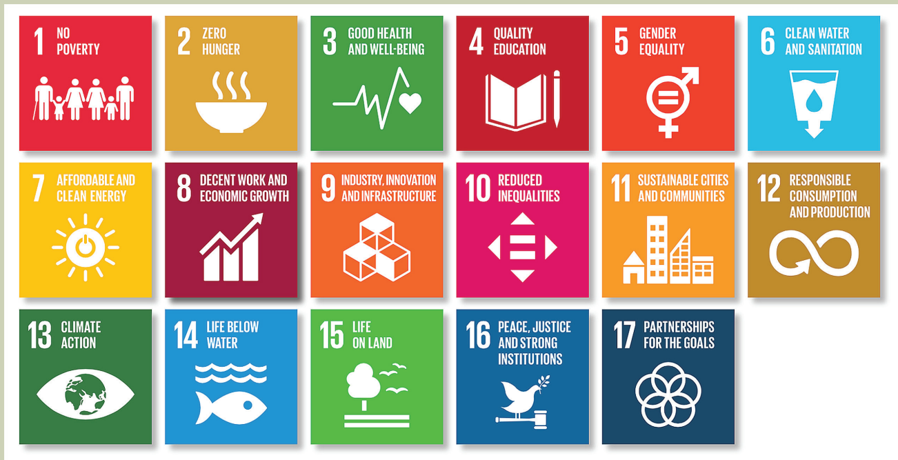
Figure 1. The UN's 17 Sustainable Development Goals.

aspects of the geosciences could help contribute to achieving many of them. The aspects included agrogeology, climate change, energy, engineering geology, geohazards, geoheritage and geotourism, hydrogeology and containment geology, and minerals and rock materials. In effect, Gill was demonstrating the importance of geodiversity to sustainable development. This idea was taken further by the Geological Society of London in producing a poster that shows how the many geoscience subdisciplines relate to the SDGs (Figure 2). But the most important publication in this regard is the book edited by Gill and Smith (2021), which has a chapter on the relevance of the geosciences to each of the 17 SDGs plus a summary chapter. Using this book as a main source, this paper aims to summarize how the geosciences have the potential to contribute to achieving these important goals. Although this paper, and indeed Gill and Smith, use the terms geoscience and geoscientists , what are really required are geopractitioners , i.e., those who have knowledge and experience in achieving better environmental outcomes from their input, rather than a purely scientific approach. As we shall see, there are strong overlaps between many of the goals, which we discuss in order below. Unfortunately, the COVID-19 pandemic has made their achievement even more difficult.