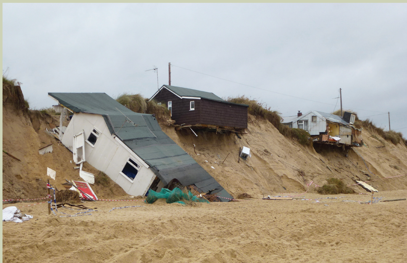
Figure 5. Coastal erosion and loss of dwellings, Hemsby, Norfolk, UK in 2013.

War, corruption, and weak institutions work against the delivery of sustainable development and the UN’s SDGs. Therefore, SDG16 stresses the importance of delivering peace, justice, and strong institutions without underestimating the problems in achieving them, as recent events in Afghanistan and elsewhere