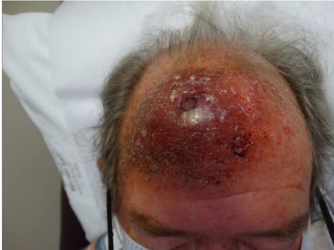
Figure 1. Violaceous forehead plaque on patient's forehead in October 2020.

positive expression of CD4, CD56, and CD123 ( Figure 3 ). Subsequent bone marrow biopsy showed mildly hypercellular bone marrow (50% cellularity) with myeloid predominant trilineage hematopoiesis. Blasts were less than 5%. There was mild megakaryocytic hyperplasia and clustering. Flow cytometry demonstrated atypical plasmacytoid dendritic cell population (0.5% of CD45+ events) with a normal karyotype. These cells exhibited aberrant expression of CD56, CD7, and CD33.