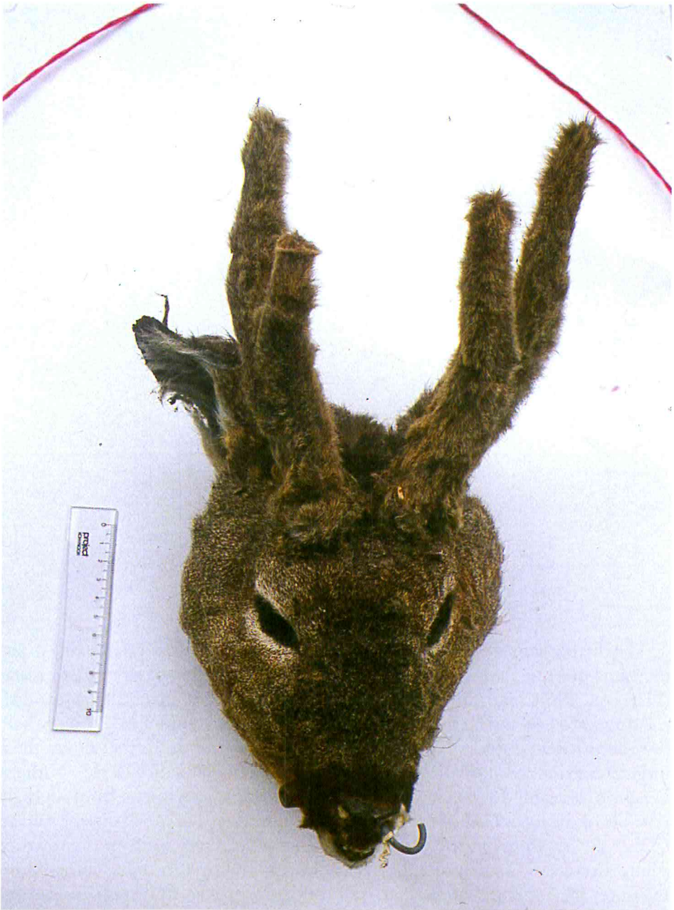
Fig. 2 - The antlers of the roe deer of Jibal al-Nusayriyah (north-eastern Syria) are covered with velvet, which is unusually long and dense. This specimen was killed in the winter 1993, Bab Janné (Sloenfeh).