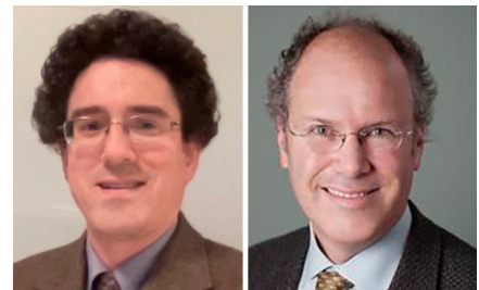
Insights from Robert A. Lindquist and William A. Weiss.

Returning to the initial approach of comparing differentially expressed genes, the authors found that EYA2 knockdown in GSCs strongly altered expression of genes involved in mitotic spindle formation. Through immunostaining, they showed that EYA2 was localized to the nucleus as classically described. In both cultured GSCs and tissue sections of surgically resected glioblastoma, there was also punctate perinuclear EYA2 immunostaining that colocalized with pericentrin, consistent with centrosomal localization. The authors stained for \alpha -tubulin and noted that the structure of the mitotic spindle was abnormal when EYA2 tyrosine phosphatase activity was inhibited or EYA2 was knocked down. The authors used total internal reflection fluorescence microscopy to visualize tubulin polymerization in vitro. Polymerization of microtubules was not altered by inhibition of EYA2, suggesting that inhibition of EYA2 must alter spindle formation through some other mechanism.