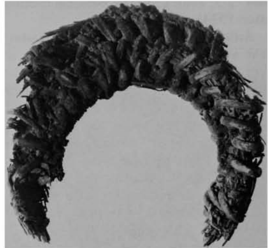
Fig. 2. The SBR-1206 basket fragment.

There are no chronometric data from the site, although nearby sites contain predominantly late prehistoric materials (USDI 1976).