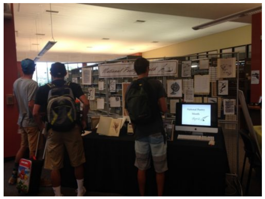
Adding new work to the April National Poetry Month display