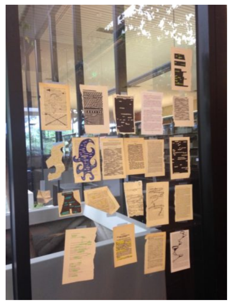
Students began to add their work to the atrium windows after writing poetry in a class session held in the atrium