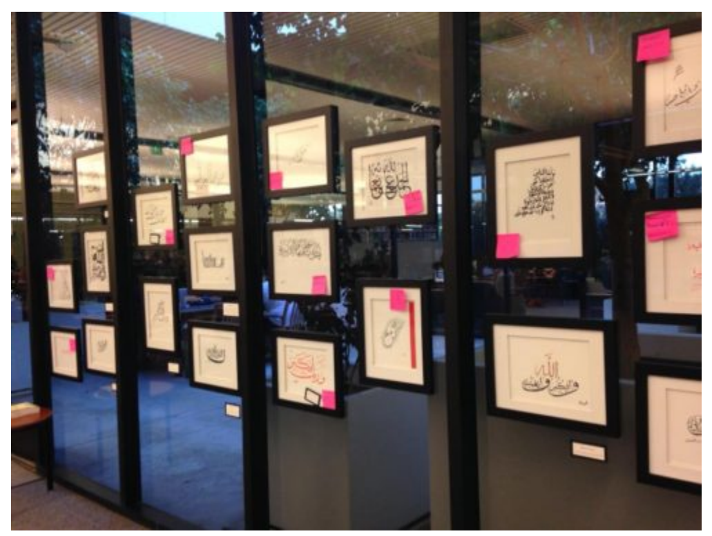
Hanging the Islamic Calligraphy Show on the atrium windows in 2014

Now for the reality check. During the 2014-2015 academic year, we were not able to realize the physical transformation of the space through renovation, though library administration approved of the ideas and design consultants were brought in. The money just wasn't available that year. But we ran a series of successful programs that demonstrated the potential of the beta reference space and generated new energy around reference services as the central arm for outreach and research support (as opposed to access services or information literacy instruction). In our first event, the atrium windows were used for the first time as gallery space for a student exhibition of Islamic Calligraphy and a small reception was held adjacent to the IC Desk in December 2014. Students and faculty came to speak about their work learning a new language and artistic technique through experiential learning in this calligraphy course.