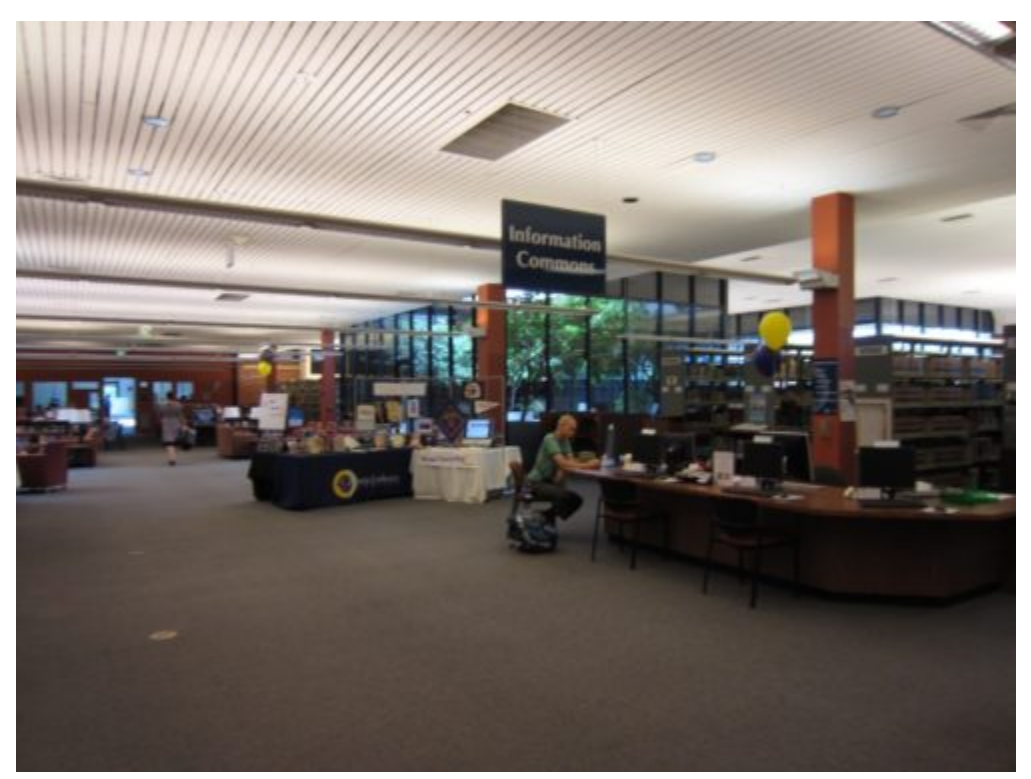
Information Commons Desk with directional sign above