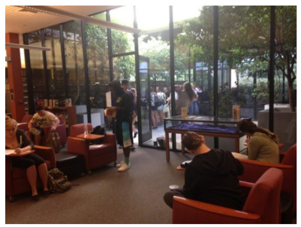
Students writing poetry inside and outside the atrium, our "Idea Box" of sorts at Pearson Library