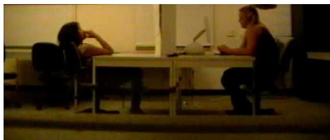
Figure 1: Screenshot of video captured during learning phase of participants assigned to occluded condition.

Participants’ speech was transcribed verbatim, and all gestures were identified. Gestures were classified as one of three types: iconic (handshape and/or motion resembles referent attributes), beat (non-iconic emphasizing), or deictic (pointing). Individual gestures were distinguished from one another by a change in hand shape or motion. For