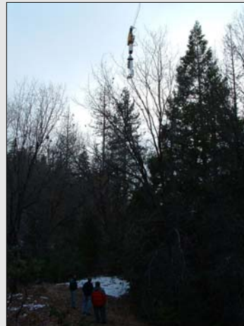
NIMS2 the James Reserve