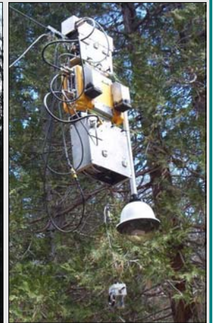
NIMI at James Reserve