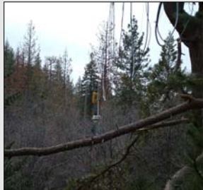
NIMS2 at the James Reserve