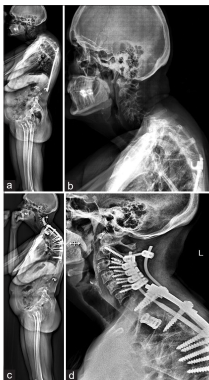
Figure 1: Pre (a and b) and postoperative (c and d) full-length standing and cervical lateral radiographs of a patient with baseline hyperlordosis (C2–C7 Cobb angle = 39.0°). By 1Y, cervical malalignment was still present, with cSVA = 86.8 mm and offset of T1 slope minus CL = 56.6°