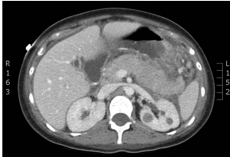
Figure 1. Abdominal CT scan showing an edematous pancreas, simple ascites, and renal cysts without evidence of nephrocalcinosis.