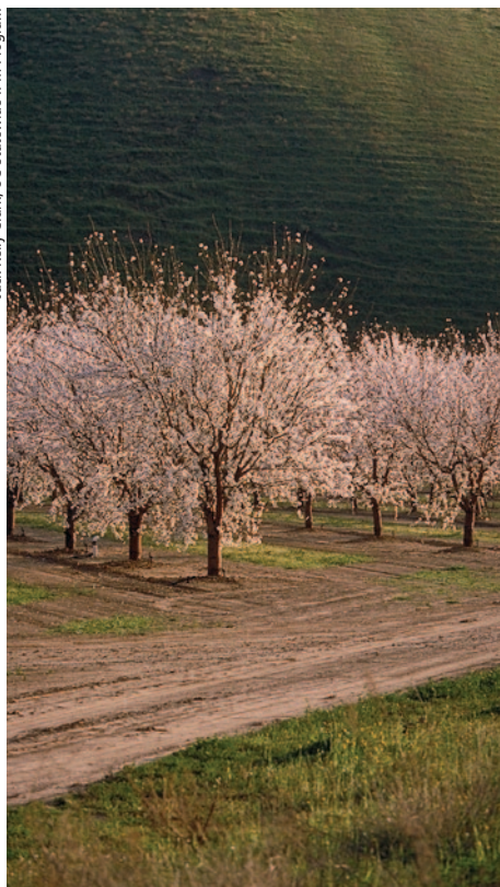
The survey found that most almond growers, managing the large majority of California acreage, currently employ best practices for nitrogen fertilization. Above, an orchard in Stanislaus County.