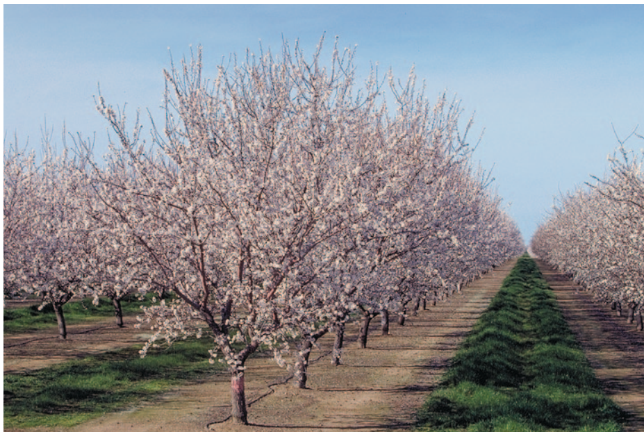
Jack Kelly Clark, UC Statewide IPM Program

Nitrogen (N) is a key mineral element for the global food supply (Hirel et al. 2007; Vitousek et al. 1997), and adding nitrogen fertilizer is a fundamental step in producing commercially viable crops. However, nitrogen that is not taken up by plants or retained in soil organic matter will “leak” from agricultural systems, contributing to environmental challenges such as greenhouse-gas emissions in the form of nitrous oxide (N 2 O) (Velthof et al. 2009) and watershed pollution in the form of high nitrate (NO 3 )