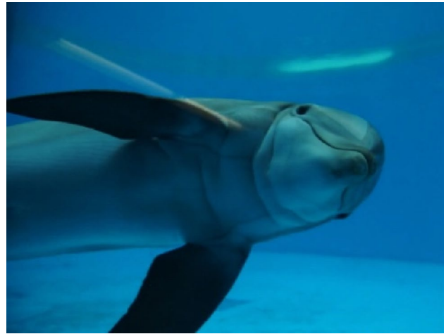
Fig. 2 Binocular vision below and forward of head

Dolphins have limited (20–30 degrees, per Supin et al. 2001) binocular vision, extending principally in front of and just below their heads, and it is only from that area that two eyes can be seen on the animal at once (see Fig. 2). In the wild, seeing down from above no doubt enables them to watch for predators and prey, as well as to monitor the behavior of conspecifics. Note too, that since mating in these animals occurs ventrum to ventrum, and tilting one's bright underside toward another can be a solicitous behavior (e.g., Johnson and Norris 1986), binocular access may be typical of such interactions. All of the above suggest that eyes are available to serve as predictive cues, correlating with the animal's direction of movement, head/body orientation, and various types of activity.