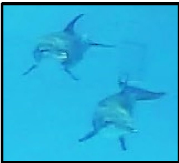
Fig. 1 Head Turns

Each eye is laterally positioned, typically providing the animal with over 200° of visual access to its surroundings (see Hanke and Erdsack 2015). Areas not typically covered include the area above and in front of their head, and directly behind their back. Dolphins are also capable of protruding their eyes, and swiveling them to get a better view either ahead or behind, and can move each eye independently. While their cervical vertebrae are fused, limiting their head movement (Thewissen et al 2009), the dolphins are still capable of turning, arching or bowing their heads, and often do so to scan their environment (see Fig. 1).