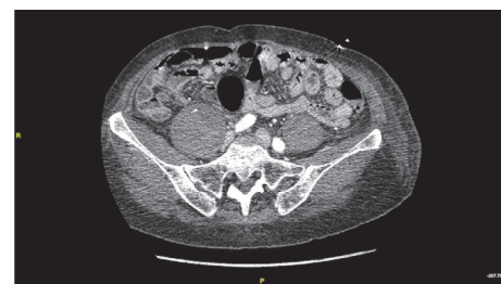
FIGURE 2: Computed tomography image with contrast in axial plane demonstrating right-sided iliopsoas hematoma as presented in case 2.

SIH is most commonly seen in patients with type A or type B hemophilia but has also been noted in anticoagulated patients and even in patients with no bleeding diathesis [1, 2, 7]. Patients undergoing head and neck free flap reconstruction are often anticoagulated postoperatively. Anticoagulation is associated with postoperative hematoma formation, although almost always at a surgical site [8].