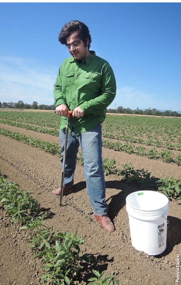
Early season NO 3 - sampling provides a measure of crop-available soil N just prior to the period of maximum uptake, helping to guide fertilization.

NO 3 - exceeds the 20 ppm threshold (Stone 2000). While starter fertilizer is applied in a concentrated band near the roots of the seedlings, soil NO 3 - is more evenly distributed across the surface of the field. As roots of seedlings explore a limited soil volume early in the season, only a proportion of the soil NO 3 - is available at early growth stages. In addition, starter fertilizer generally contains N in the form of NH 4 , which has been found to improve P uptake (Grunes 1959).