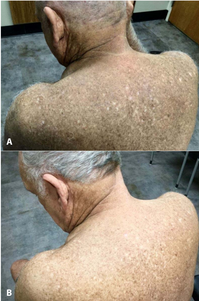
Figure 1. Clinical photographs of lichen amyloidosis before and after treatment. A) Patient's back before treatment revealing generalized subtle, rippled, dyschromic gray-brown thin plaques. B) Patient's back after 9 months of treatment with dupilumab showing improvement of skin texture and dyschromia.

HIV testing was declined by the patient and considered low risk owing to lack of risk factors. Serum IgE was mildly elevated at 200kU/l (normal 10-100kU/l). A complete blood count with differential noted hypereosinophilia of 1500 cells/ \mu L (normal 15-500 cells/ \mu L). Additional testing for causes of hypereosinophilia including a complete evaluation by an allergist, serum tryptase, stool ova and parasite, peripheral flow cytometry, and bone marrow biopsy were unremarkable.